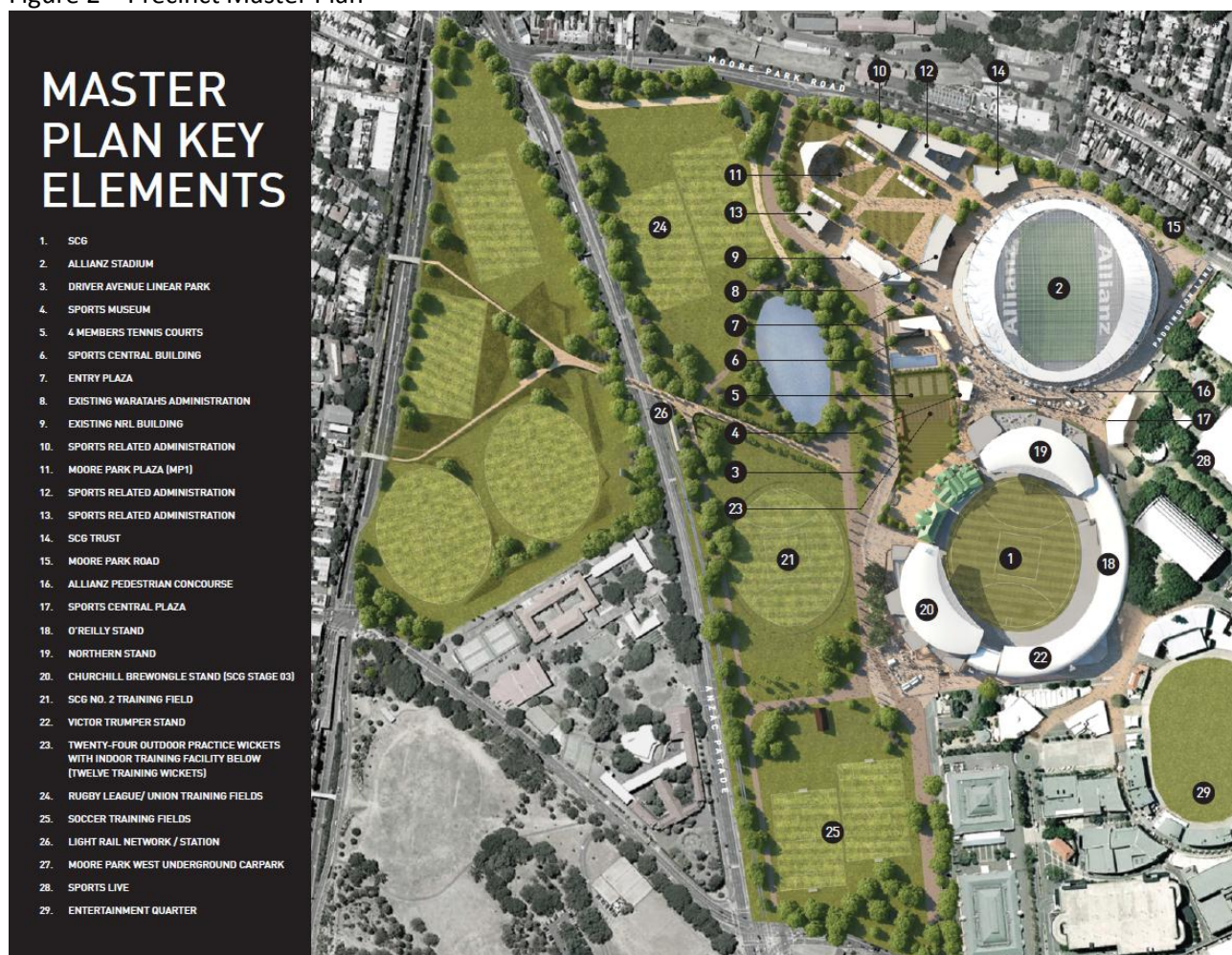
Figure 2 – Precinct Master Plan

The significant advantage of the Precinct, when compared to other Sydney sports hubs, is its connectivity and accessibility to the Sydney CBD and local neighbourhoods. It is able to attract both events and tenants to the Precinct as patrons are able to also access transport infrastructure as well as dining and entertainment Precincts. This accessibility would be significantly enhanced by implementation of the pedestrian and transport initiatives identified in the Master Plan.