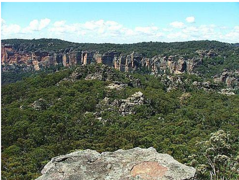
Well-developed platy pagodas (centre of picture) on Genowlan Mountain, looking towards start of Genowlan Point

The suggestion on p. 38 that pagodas will typically crack but that total collapse does not happen is not a rule. In fact pagodas undercut by caves or that are tilted have collapsed from subsidence in other parts of the Western coalfields. As p. 38 notes, pagodas are ‘sensitive surface features’, for this reason one does not remove two thirds of the coal in voids 61 metres wide underneath them. The plan to remove 50-60% of coal under talus slopes (depending on depth of cover in partial pillar extraction areas) is reprehensible. One can liken it to removing half the flying buttresses that hold up tall cathedral walls. The claim on p. 38 that 66% coal extraction will have no effect on talus slope vegetation is also questionable as major cliff collapse will have major effects on this community.