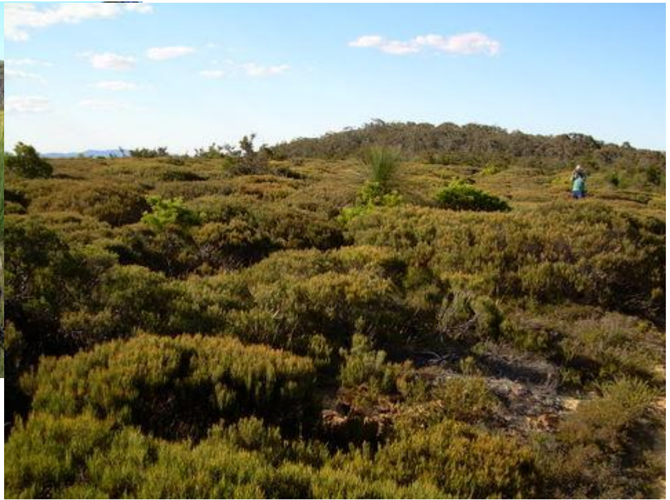
Genowlan Point heathland EEC

Genowlan Mountain and Point are actually hot spots of botanic biodiversity (as well as geodiversity). The failure to find 13 plants, 3 of which are ROTAP listed and two of which are very uncommon raises concern as to the thoroughness of the botanical survey . The failure to find an obvious species – Grevillea arenaria subsp. arenaria adds to this concern.