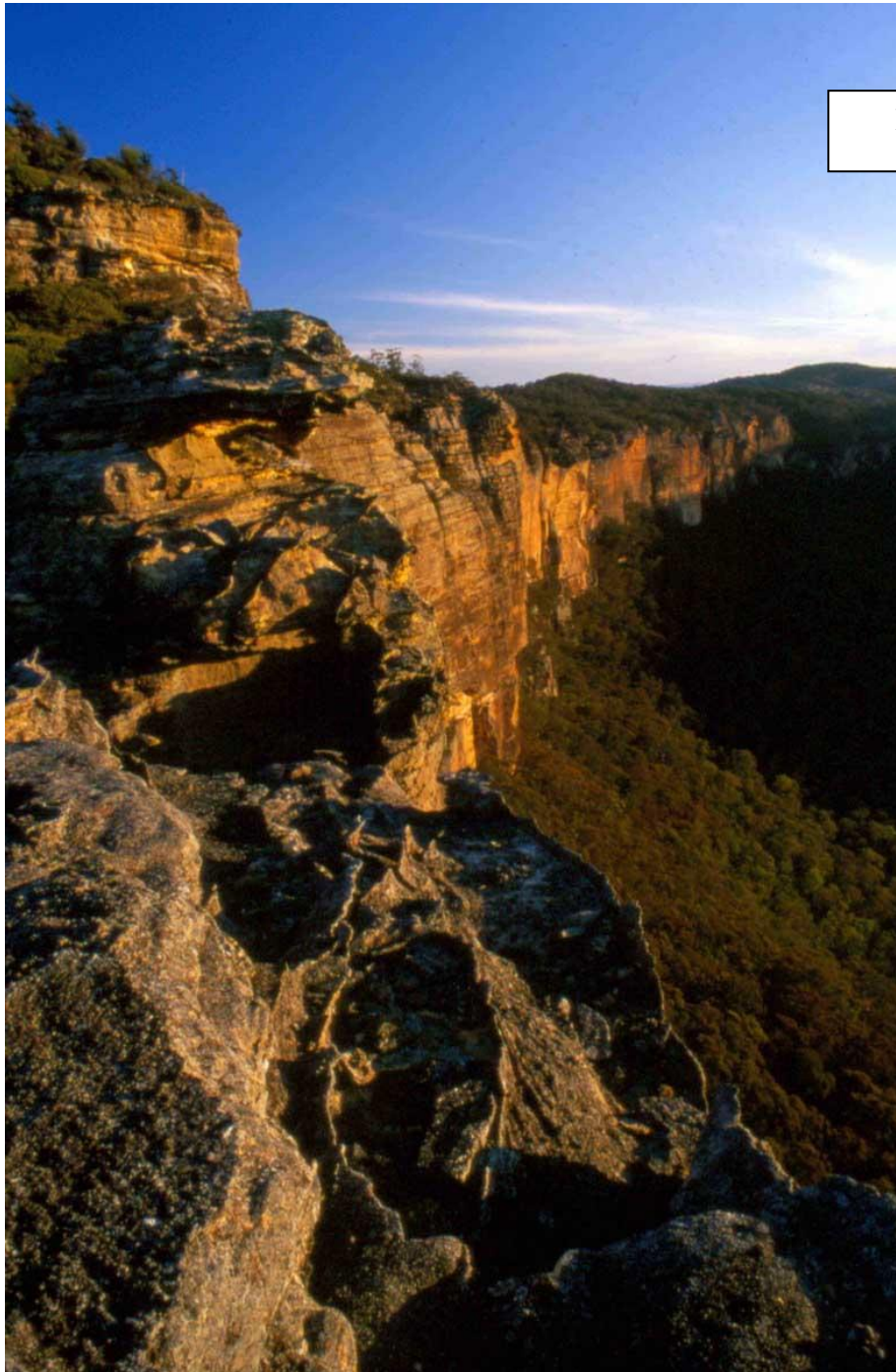
High cliffs, Genowlan Point

are two variants – ‘single sided lifts’ and ‘double sided lifts’. However it seems extraction here will be around 50% for the former and 60% for the latter. Under steep talus slopes supporting high cliffs, we feel these areas should be first workings only – with 30% extraction. The precautionary principle tells us that this is appropriate to ensure the long term integrity of talus slopes and the cliffs they support. The maps provided in the EIS are inaccurate but the key historic ruins seem to lie above this zone (possibly the shallow zone). These ruins are of such significance that there should only be first workings (30% extraction) under all the ruins in whatever zone they are located.