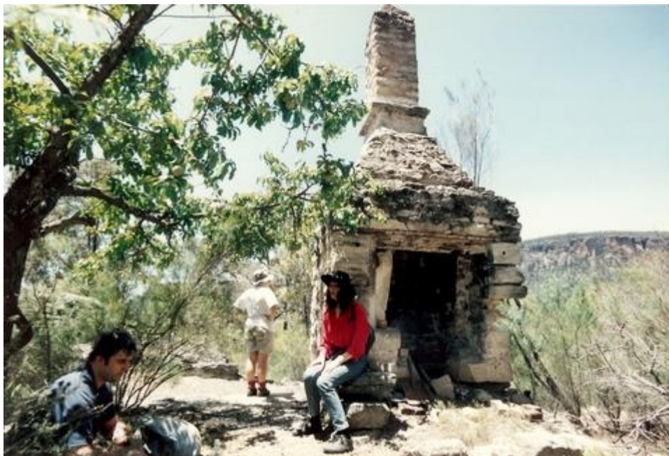
German bake-house, Mt Airly historic ruins

The EIS makes the claim that subsidence under historic sites will only be between 0 and 10 mm, however this does not conform with any of the subsidence figures for the mining zones and is clearly an error. It sounds good but is not supported elsewhere in the document. Extraction should be limited to first workings (30% extraction) only under this important heritage (though 50-60% extraction seems to be proposed on p. 375).