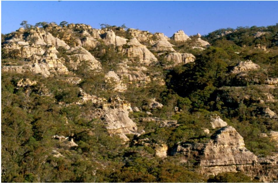
‘City in the Sky’ north of Genowlan Mountain trig shows both excellent smooth pagodas as well as platy pagodas.

The suggestion on p. 38 that pagodas will typically crack but that total collapse does not happen is not a rule. In fact pagodas undercut by caves or that are tilted have collapsed from subsidence in other parts of the Western coalfields. As p. 38 notes, pagodas are ‘sensitive surface features’, for this reason one does not remove two thirds of the coal in voids 61 metres wide underneath them. The plan to remove 50-60% of coal under talus slopes (depending on depth of cover in partial pillar extraction areas) is reprehensible. One can liken it to removing half the flying buttresses that hold up tall cathedral walls. The claim on p. 38 that 66% coal extraction will have no effect on talus slope vegetation is also questionable as major cliff collapse will have major effects on this community.