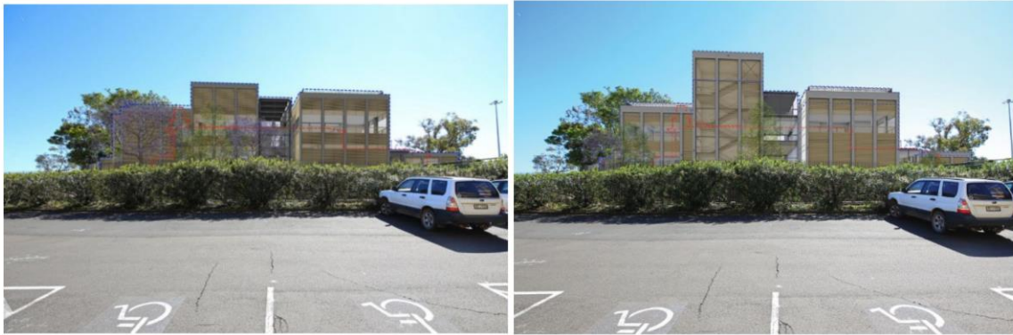
Figure 5.40: View north from National Trust Site, approved SSD (L) vs s4.55 (R). Additional partial-storey massing centralised on Building J visible but does not create a substantially different view from the approved design (Ethos Urban VIA 2021. Viewpoint 3)

The new view from the National Trust of Australia is just appalling to see this from a heritage site: