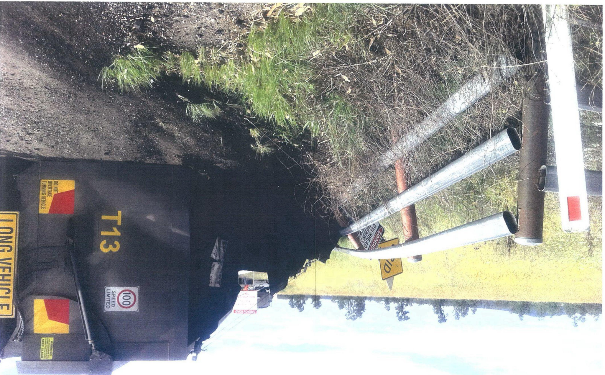
Truck Roll over Jan. 13 th 2012. (Friday)