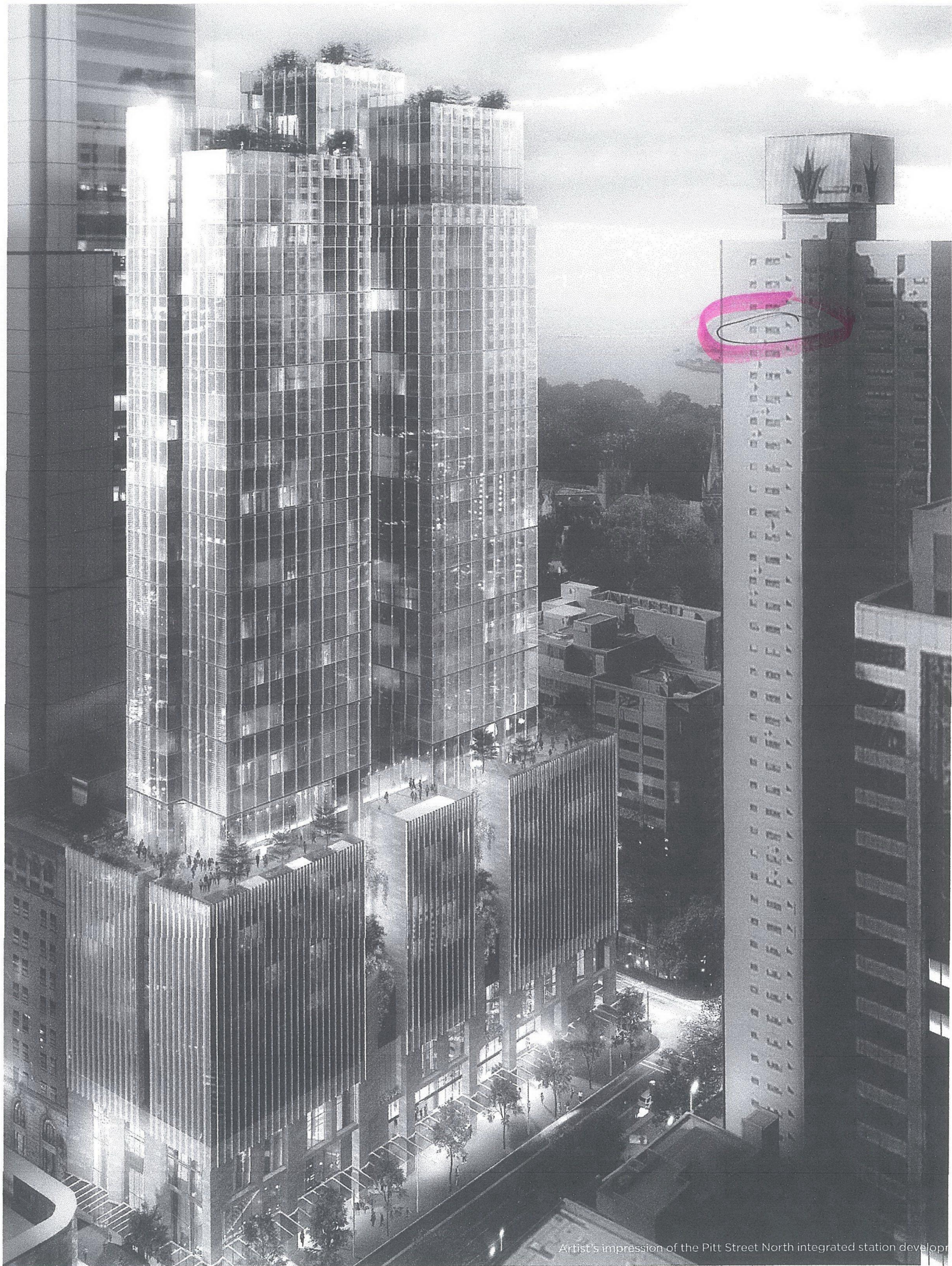
Artist's impression of the Pitt Street North integrated station development