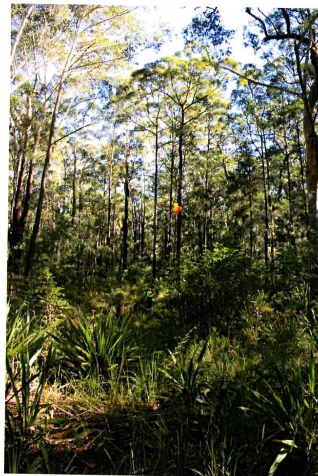
Plate 12: Showing tree measuring by means of balloon flotation height