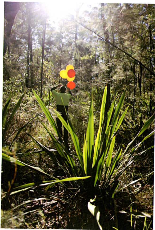
Plate 11: Showing tree measuring by means of balloon flotation height