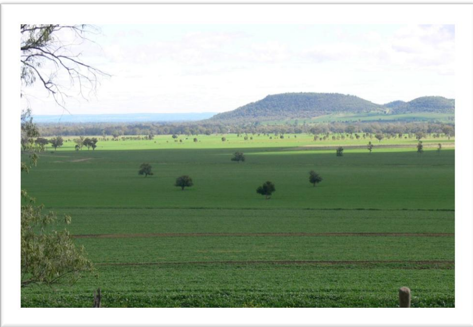
Wheat on Roslyn 2008