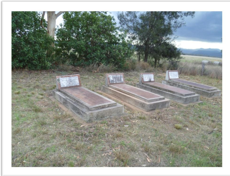
Laird Family Cemetery –“Roslyn”, Maules Creek