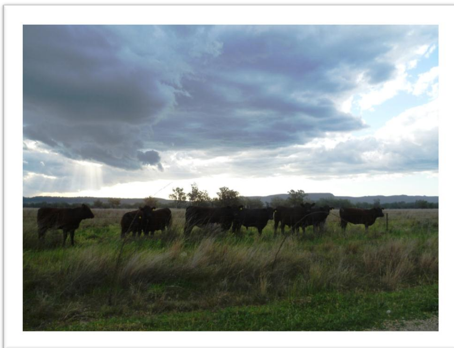
Cattle on Roslyn 2011