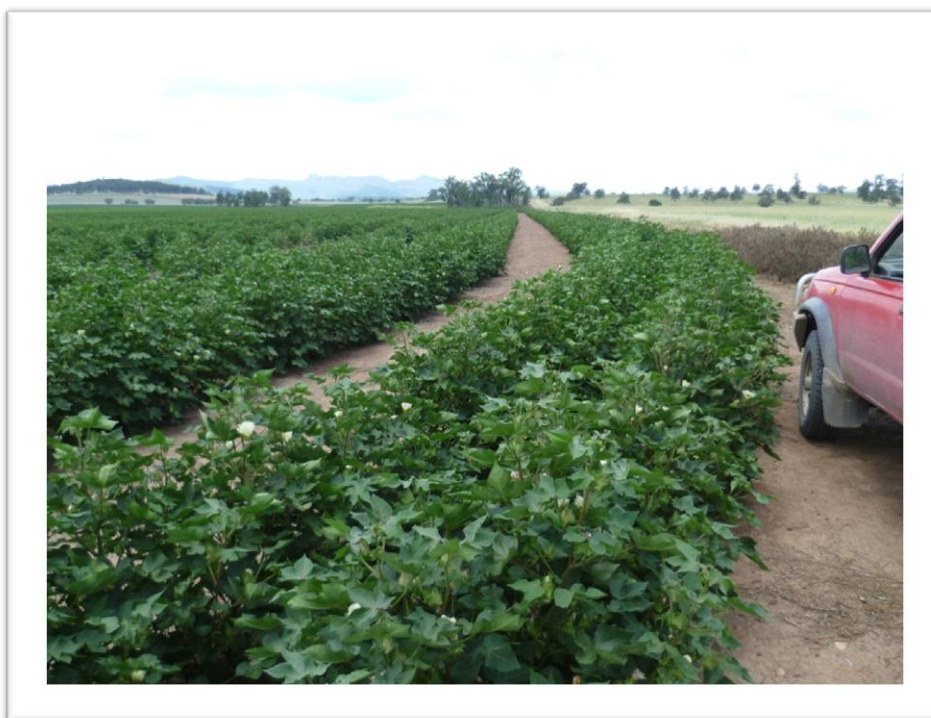
Dryland Cotton 2011