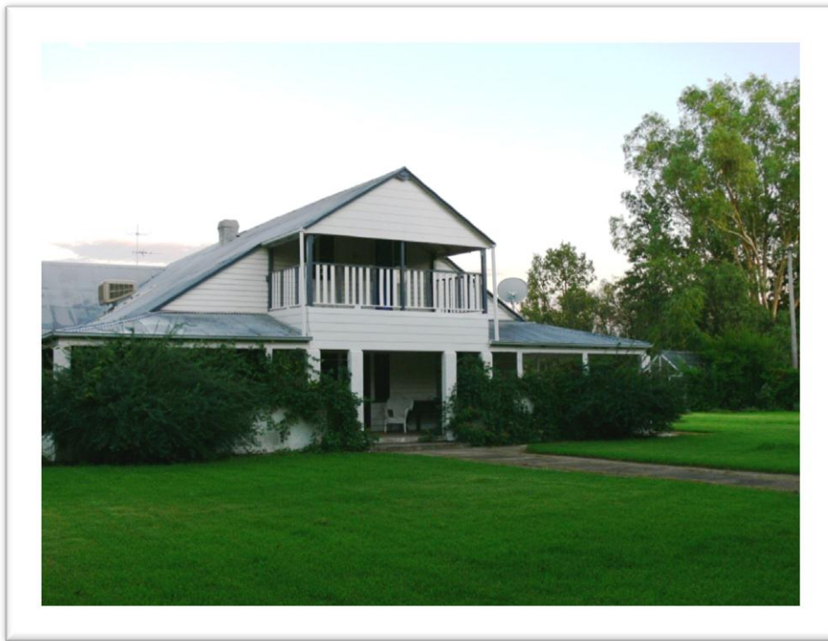
“Middle Creek South” House - Today