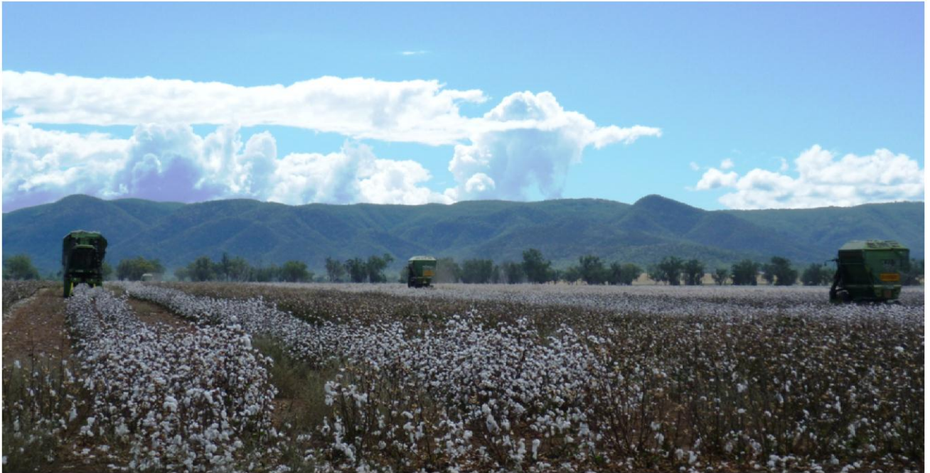
Dryland Cotton 2011