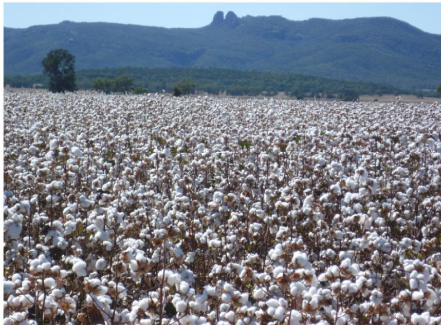
Dryland Cotton 2011