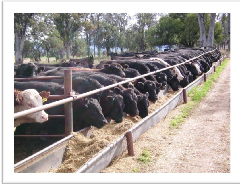
Cattle on Roslyn 2011