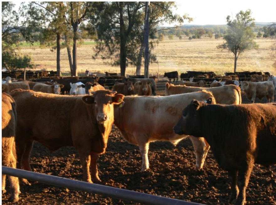
Feedlot on Roslyn