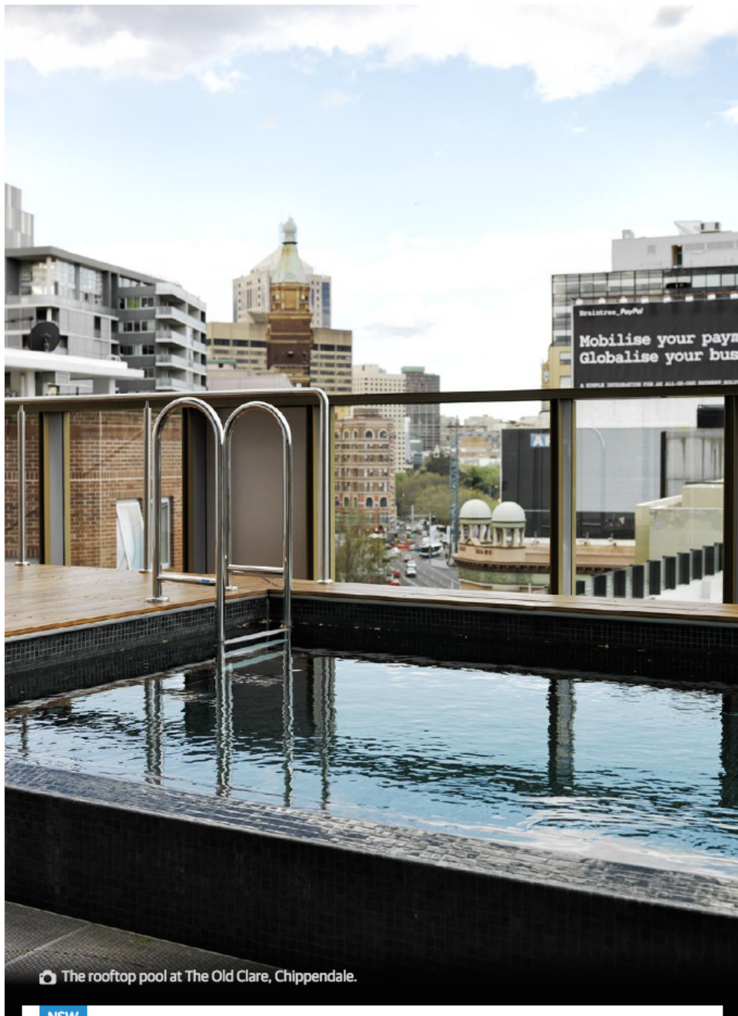
The rooftop pool at The Old Clare, Chippendale.