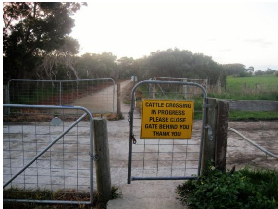
Gates open for herd crossing – view from bicycle path