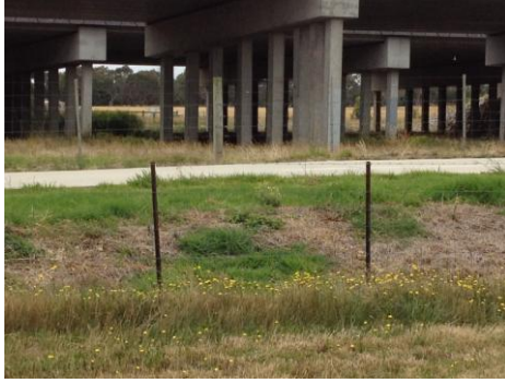
Area under Peninsula Link bridge

The physical impacts of bike paths on stock movement are clear; ultimately there will be conflict and the most likely resolution will be restrictions on the movement of the milking herd.