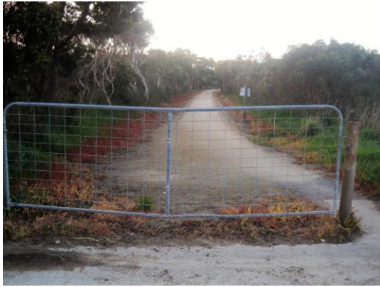
Access gate for cyclists and walkers