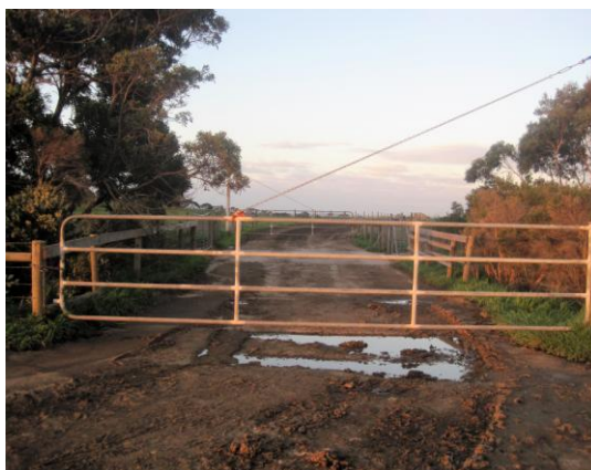
Gate on cattle track – back from crossing

The approaching track is 4.5 metres wide and the cow flow across the path is 4.5 metres wide. Despite this, the herd can take 10-15 minutes to pass over the concrete path.