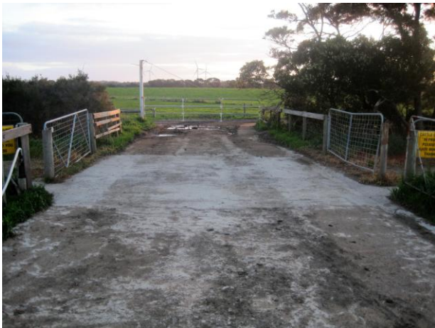
View from cattle track – note manure build up