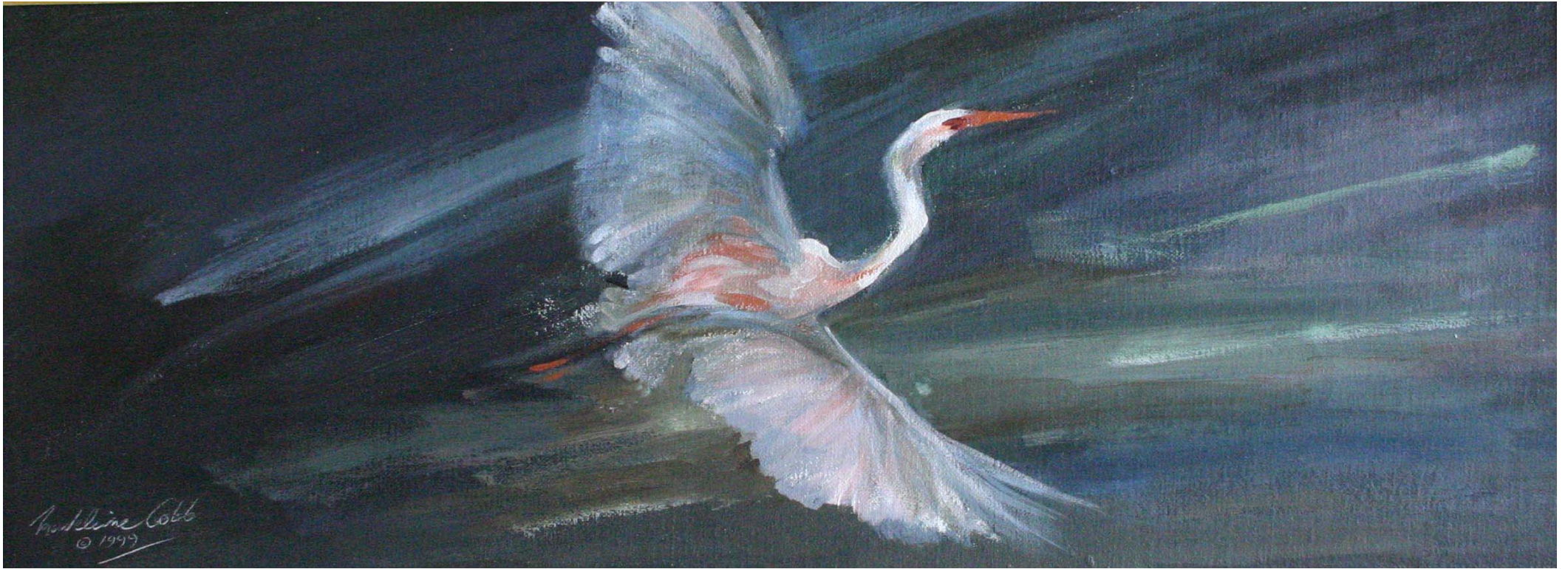
Herons Flight Acrylic 30x80 Cm