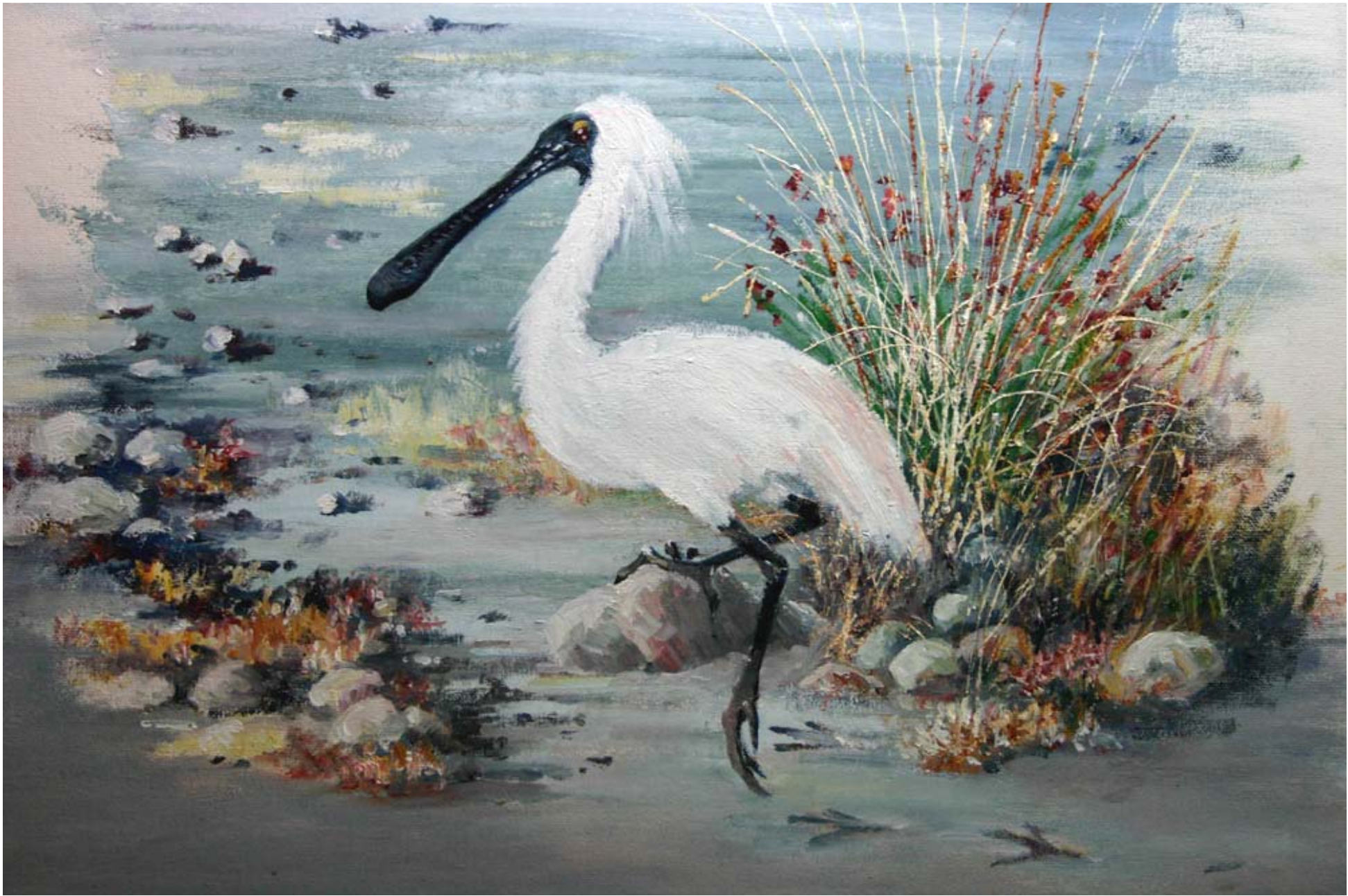
Spoonbill, for book cover illustration and design, Sou'West Victoria Bird Observers' Guide.