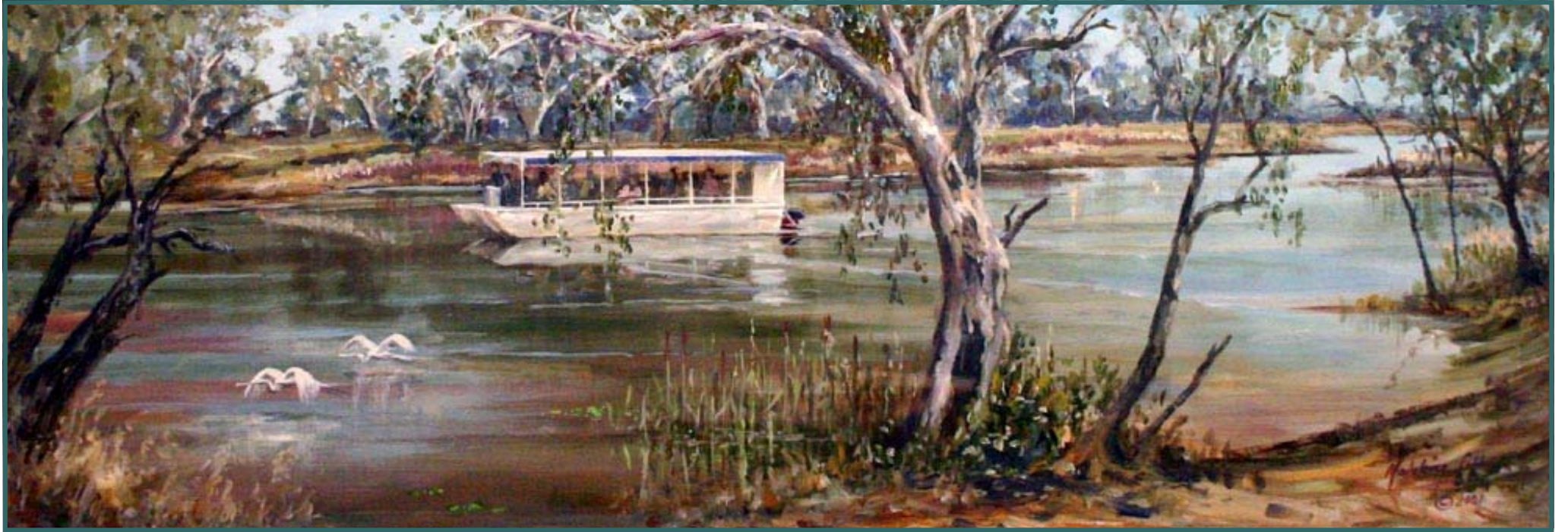
Maranoa Riverboat Acrylic 1m 30cm x 50 cm