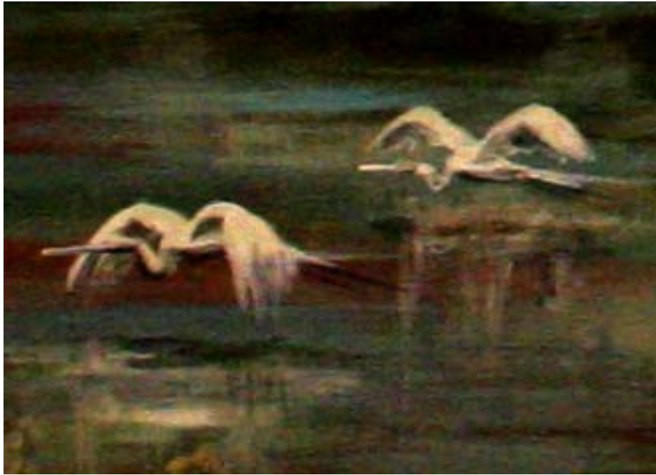
Herons ... acrylic, detail from Maranoa Riverboat...