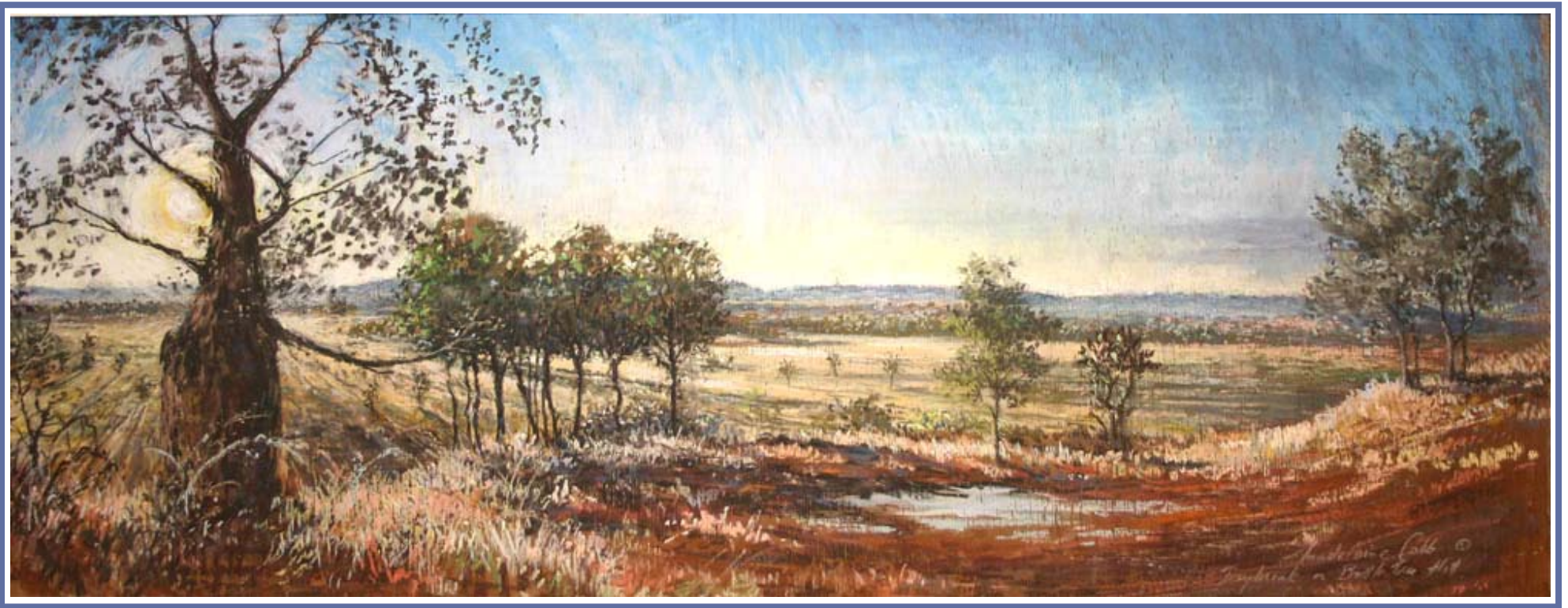
Daybreak on Bottletree Hill Pastel 50" x 20" Purchased by Boorunga Shire Council $7,000