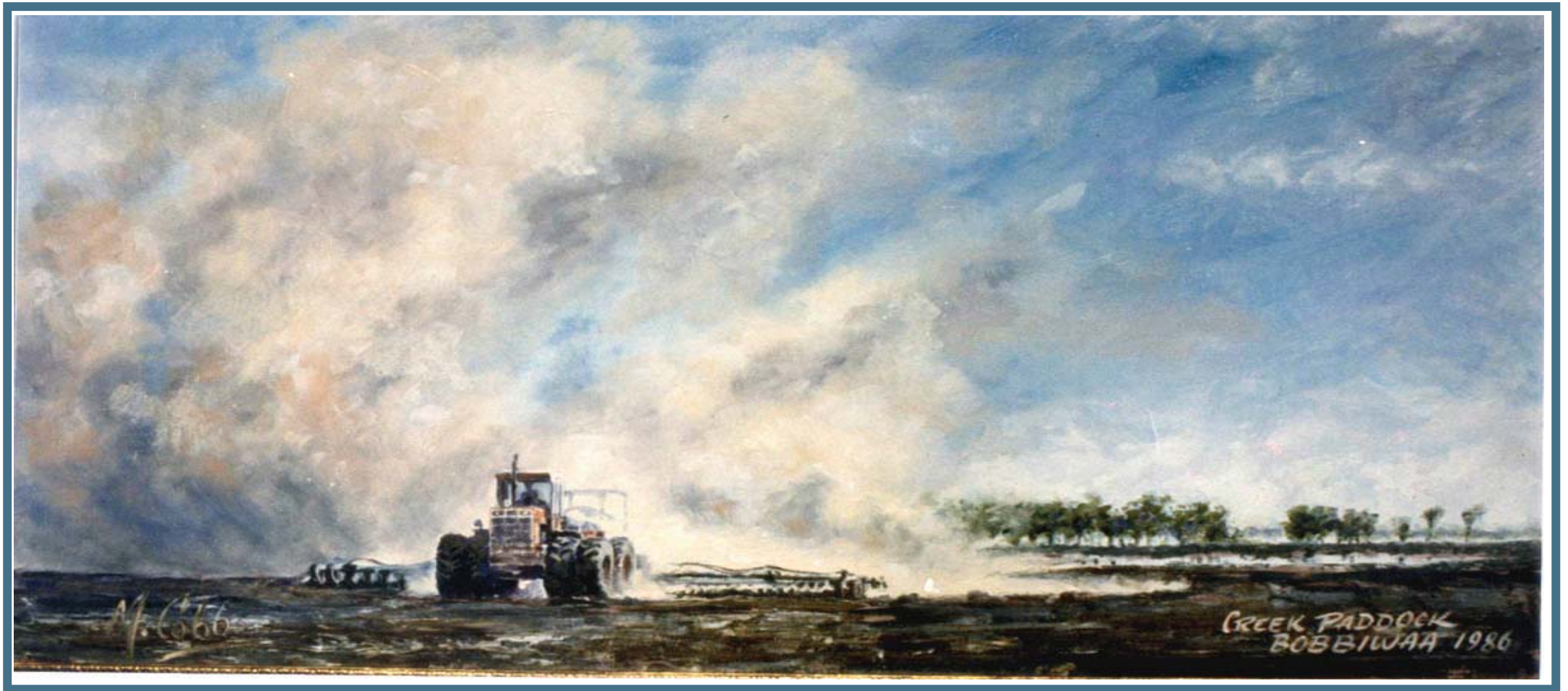
Triple Mirage for Mark Lampe Bobbiwaa Narrabri NSW Oil 5' 6" x 2' 8"