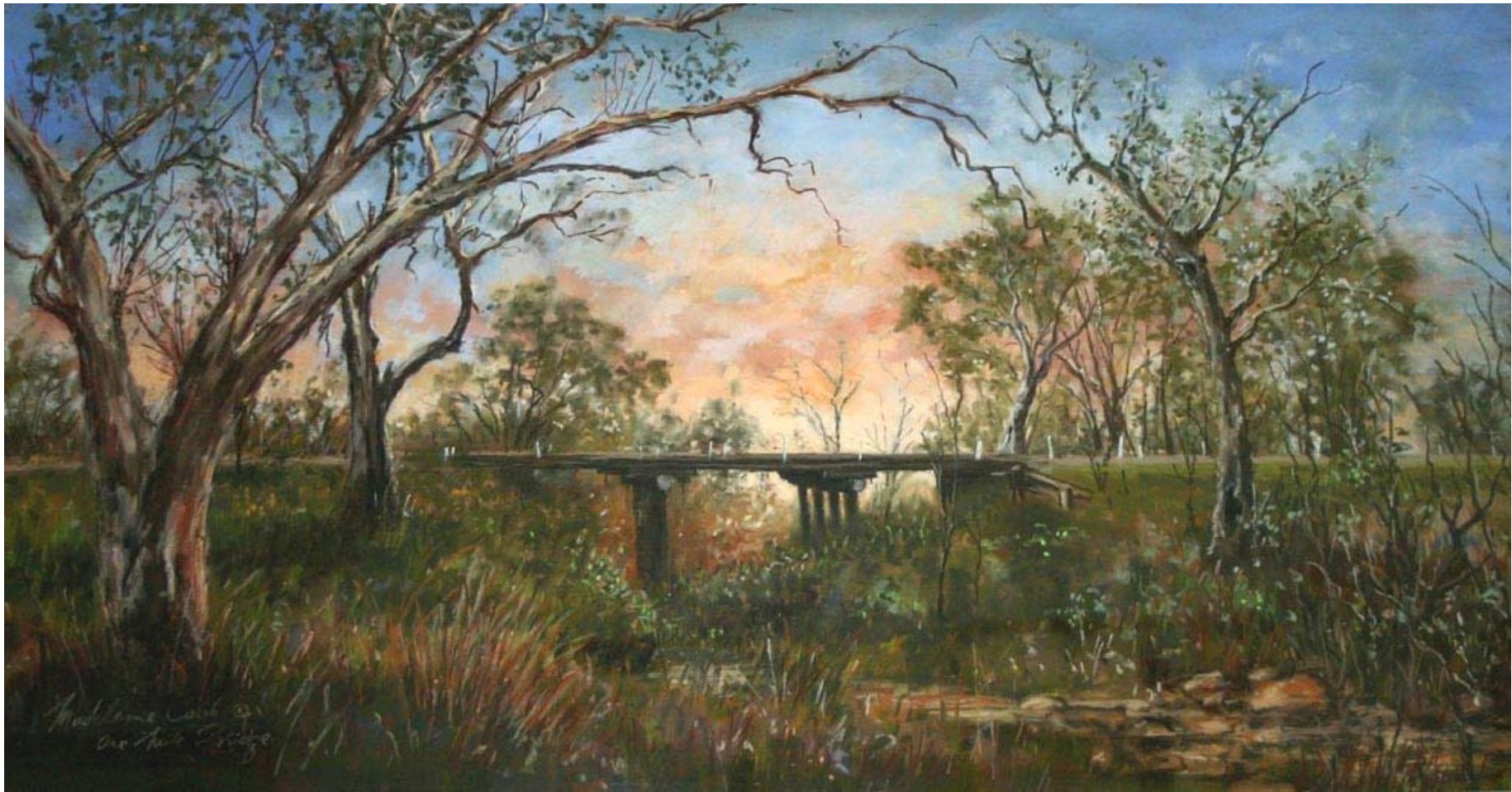
One Mile Bridge Pastel 40" x 20" Purchased by Boorunga Shire Council $7,000