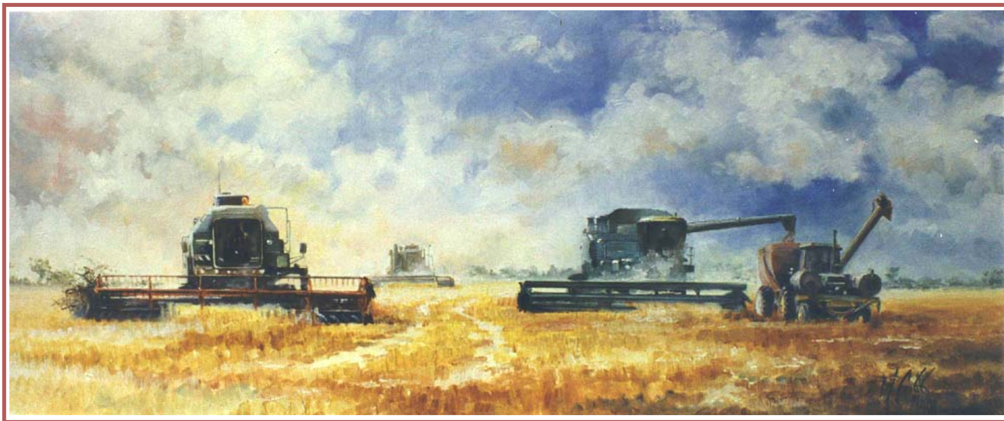
Harvest for Peter Glennie Norwood Moree NSW Oil 5' x 2'