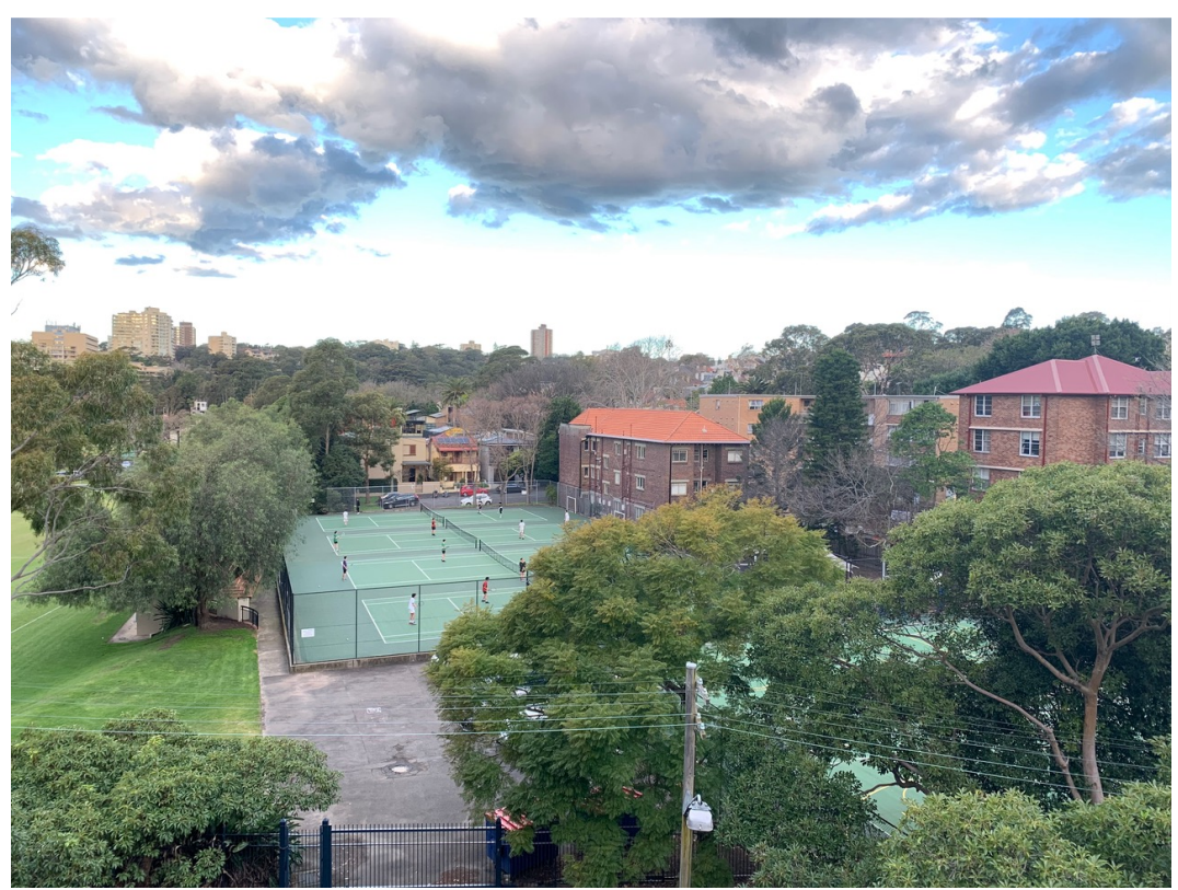
On 5 Aug 2020, at 5:12 pm, Lisa Chikarovski wrote: