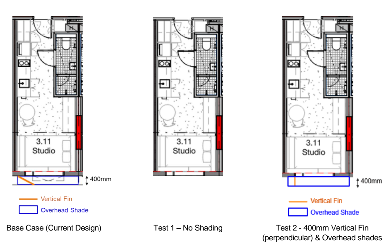
Figure 3 Design Options

The details of the analysed design options are illustrated below.