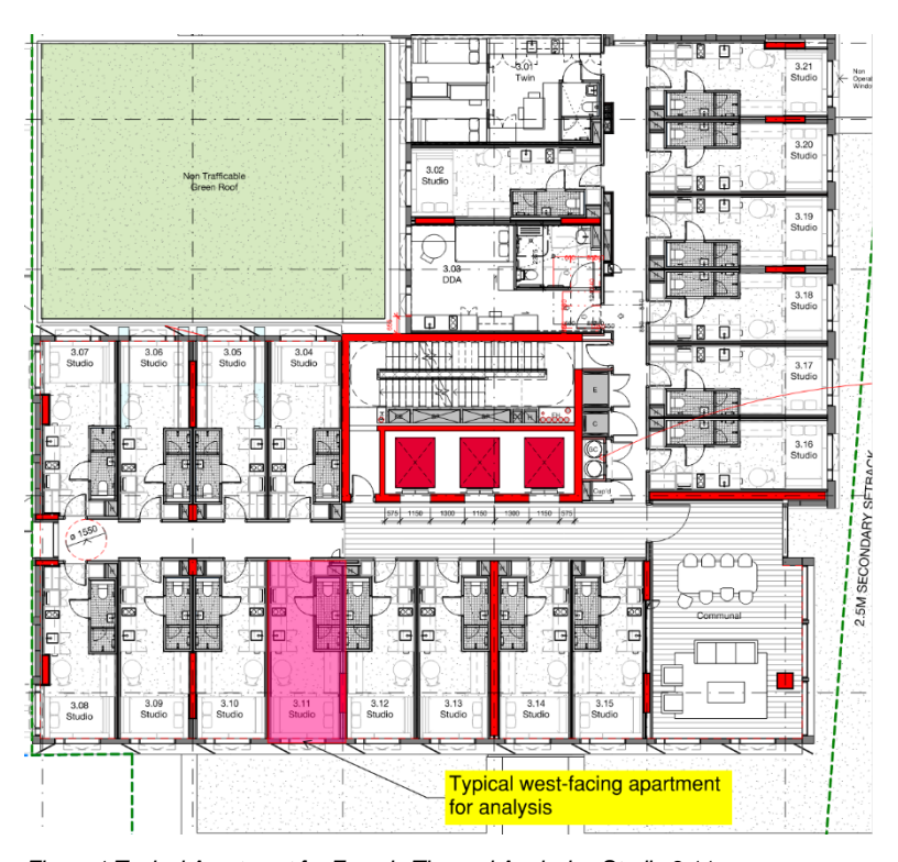
Figure 1 Typical Apartment for Façade Thermal Analysis - Studio 3.11

A 3D geometric model of the studio was built in Rhino. The façade of a typical west-facing apartment (Studio 3.11) is selected as the Base Case. The layout and façade details modelled are as below.