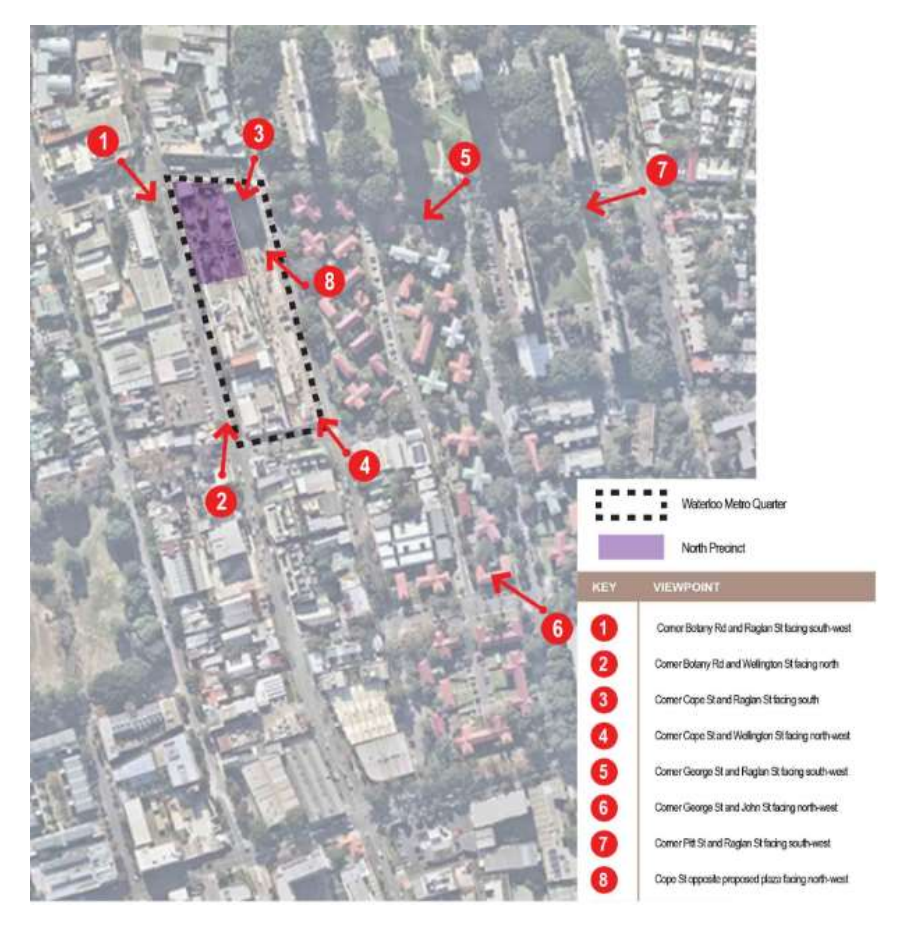
Figure 6: Local Views within the Waterloo Metro Quarter Precinct

The VIA identified that medium-distant views of the Building from other viewpoints in the Waterloo area were limited, being: (i) behind other building groups in the precinct (viewpoints 2 and 4), and (ii) almost completely screened by the existing very tall buildings and the substantial stock of tall, forest scale trees within the precinct (viewpoints 5, 6 and 7). Hence the proposed building (lowered even further) will have even less visibility.