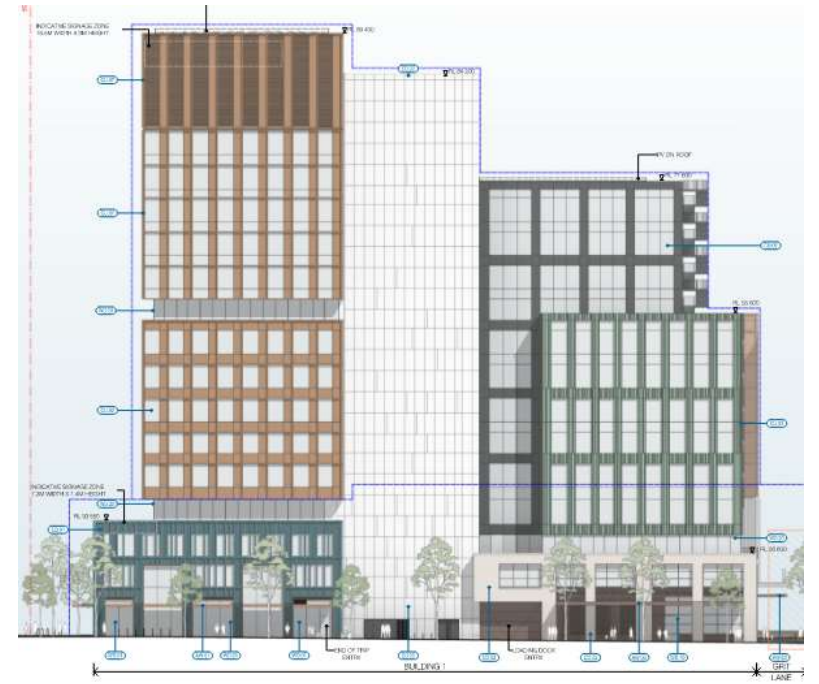
Figure 4: Western elevation (Botany Road) – as submitted (Sheet No. WMQ-BLD1-WBG-AR-DRG-DA121 Rev C dated 28/8/20 by Woods Bagot Various Building Heights as per Blue Line: Planning Envelope profile: RL 89.4; RL 84.2; RL 71.6