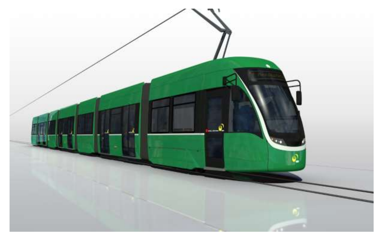
Figure E1 – Bombardier Flexity 2 conventional tram – same model as Gold Coast tram

APPENDIX E – Comparison of a modern 43 metre tram with a bi-articulated 25 metre hybrid bus