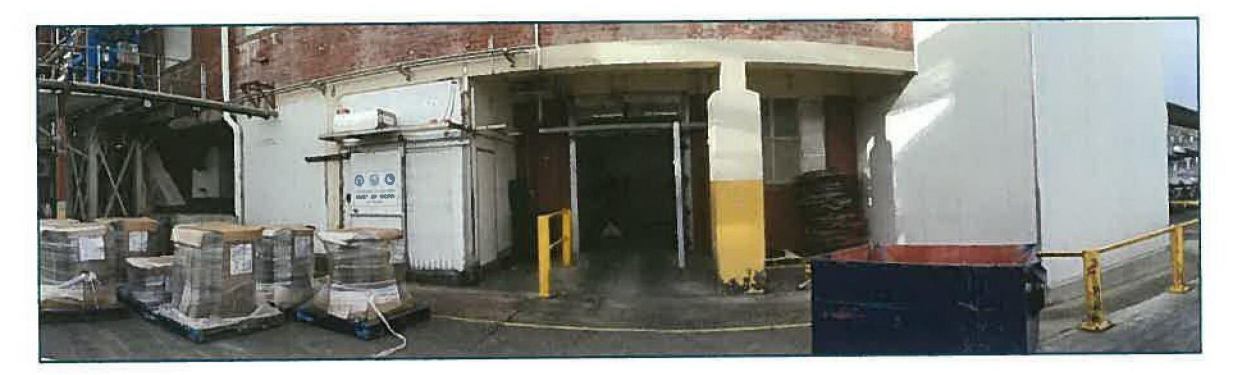
Inage 2: Existing Box Room