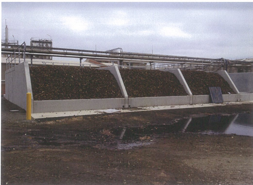
Figure 2: Similar style biofilter to be constructed by Teys Wagga, picture taken at another facility