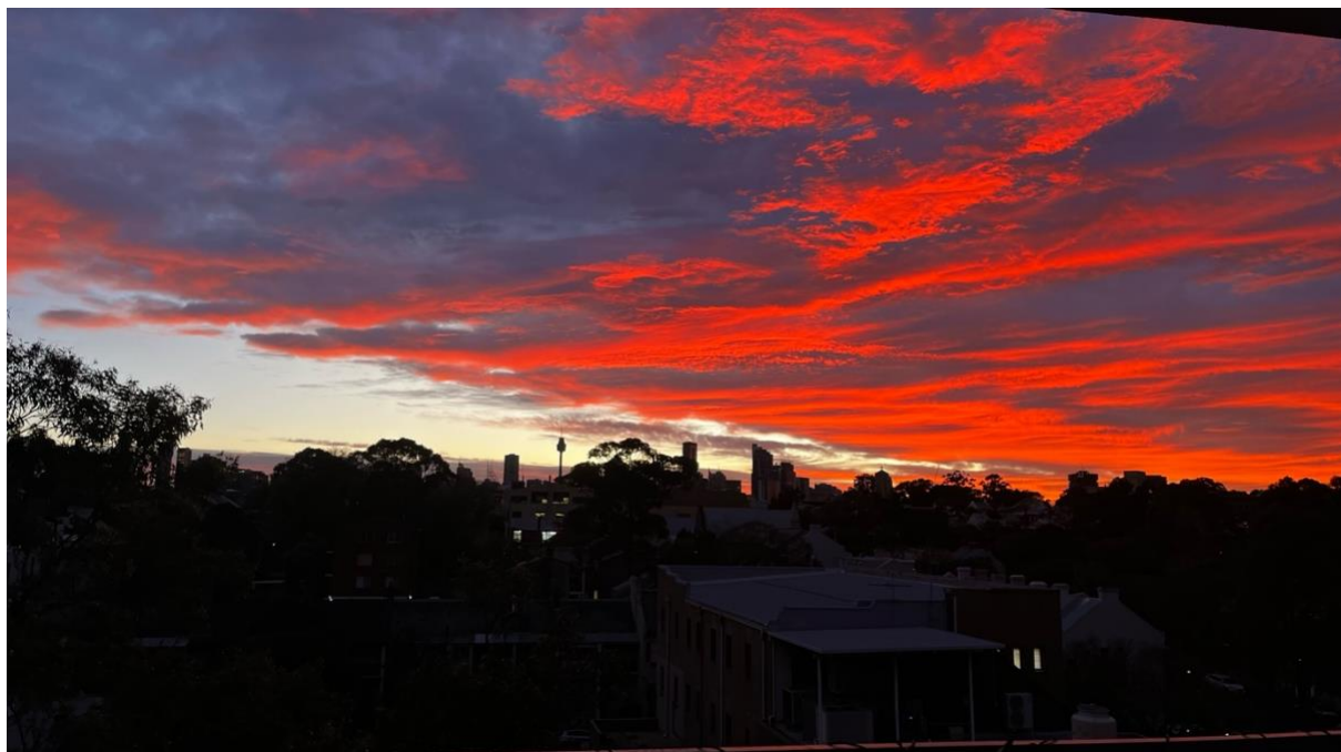
Figure 1 sunset from balcony with Centre Point tower, 03/11/24