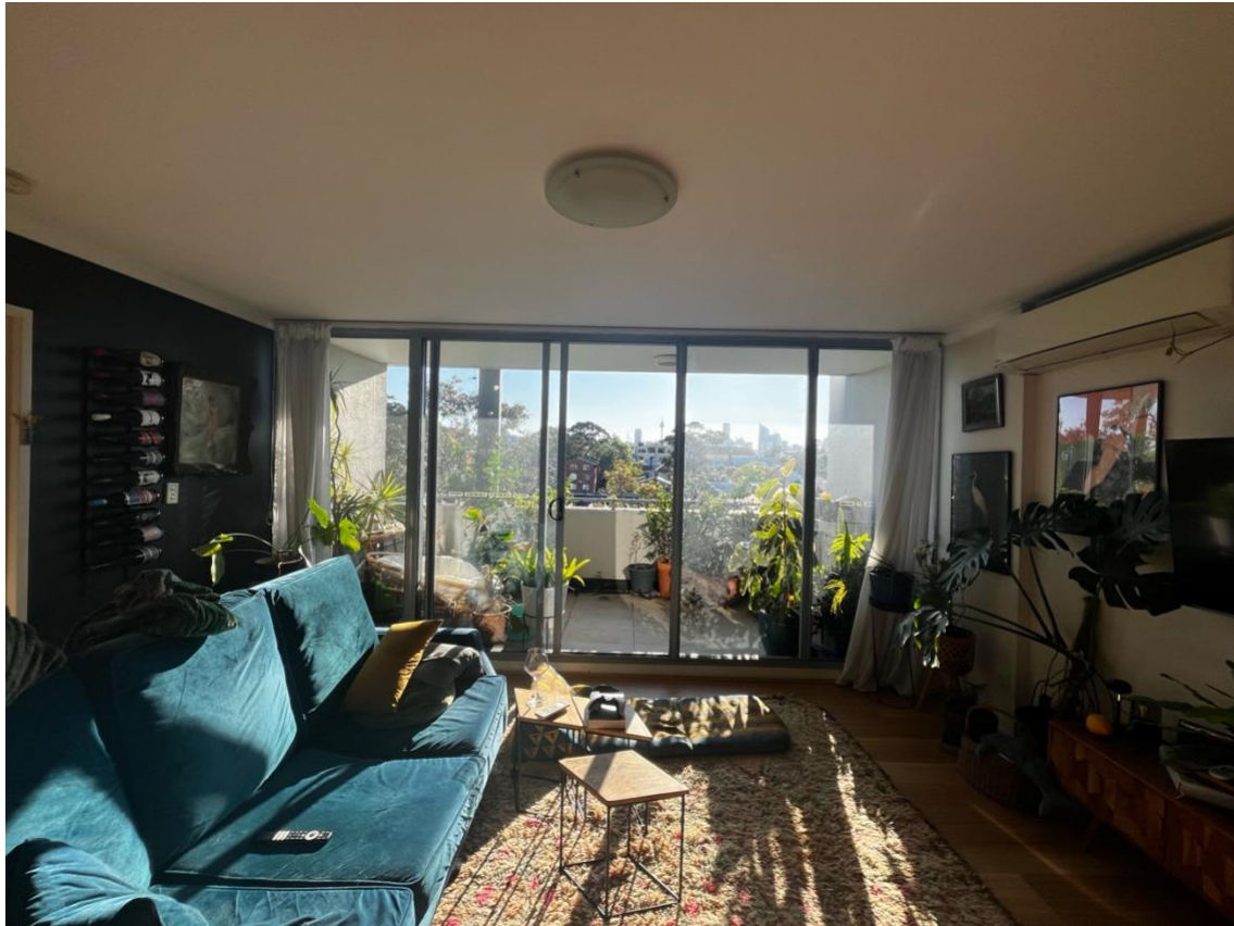
Figure 5current view from my kitchen, while standing 13/09/25