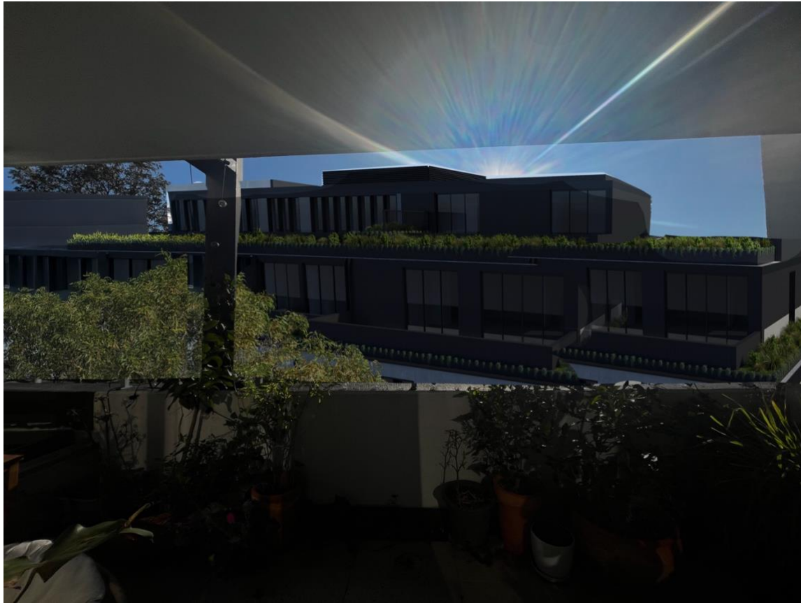
Figure 7 layman's mock-up of view infringement, while standing 13/09/25, taking 95% of my sun light and 100% of the view.