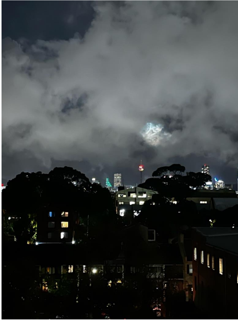
Figure 4 Close-up of centre point tower with Vivid lights, 12/02/25

Below is my own basic mock-up, from my balcony, shows the view will be entirely lost. I do not trust their reports to accurately reflect the true impacts on my home.