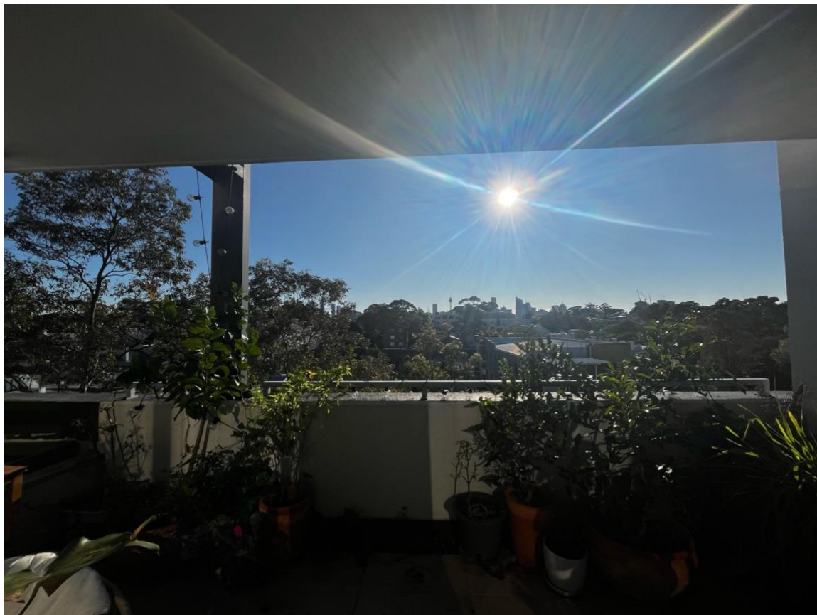
Figure 6 Current view from my balcony, while standing 13/09/25