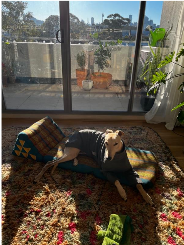
Figure 1 My dog and I enjoying the morning sun, 19/06/24

OBJECTOR: Adair Imrie, Owner/Occupier of Unit 619, 1-3 Larkin Street, Camperdown