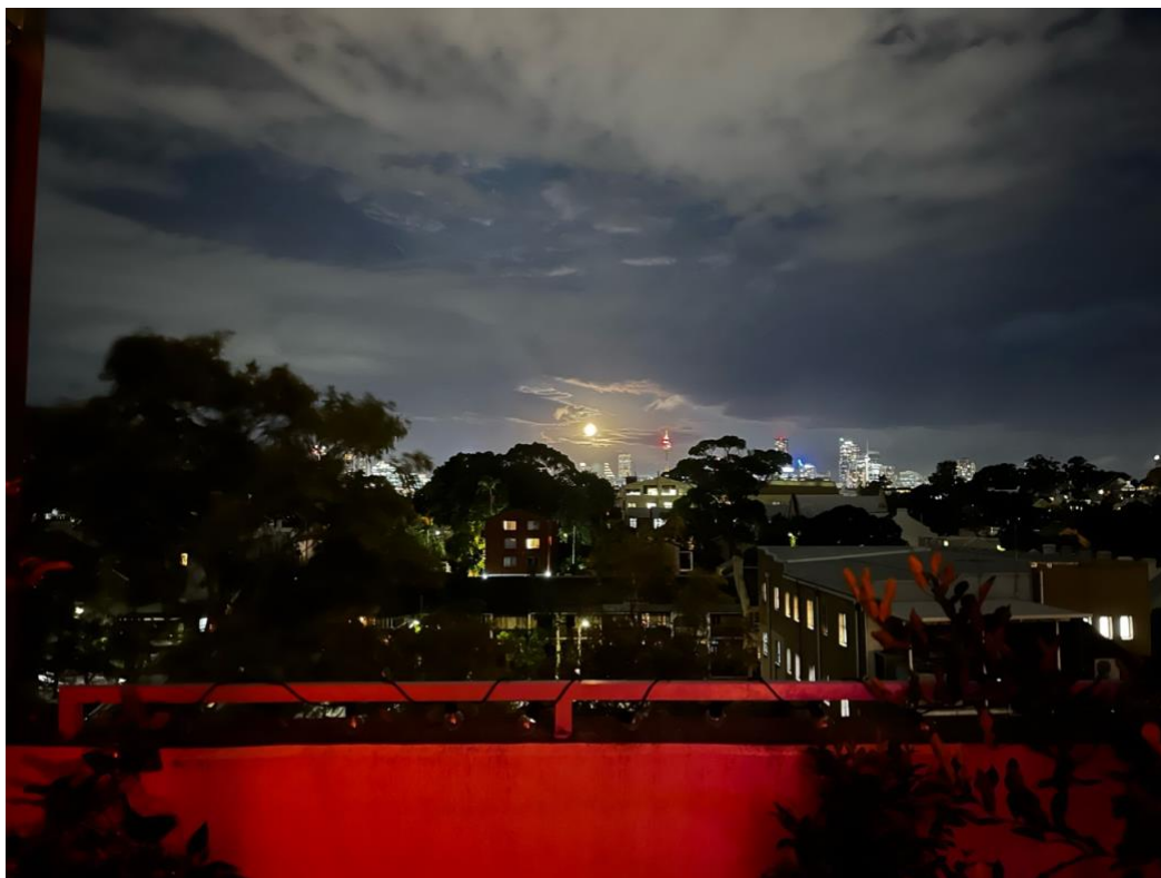
Figure 3 night lights from the balcony, while standing, 12/02/25