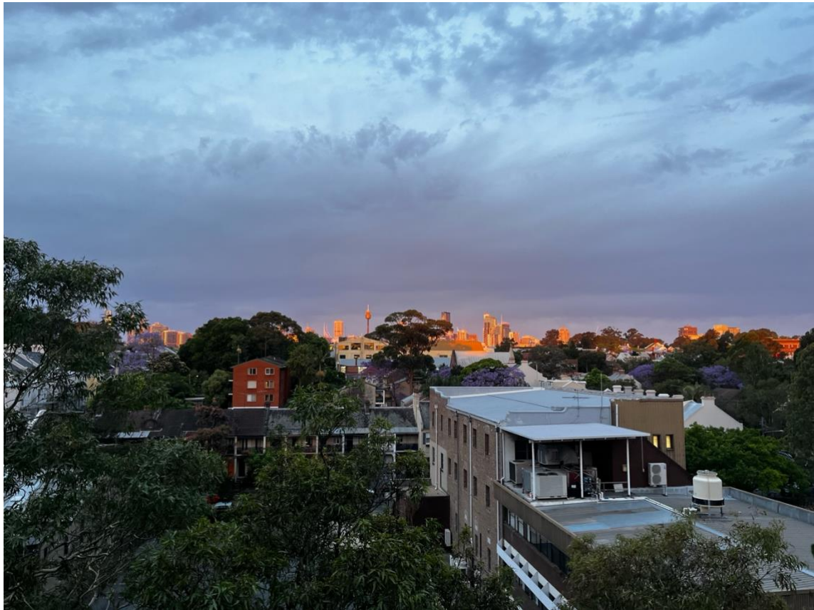
Figure 2 sunset kaleidoscope of colours, 14/01/25