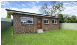
Padstow | Sydney