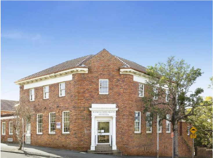
This old bank in Roseville is already going to be developed into two apartments