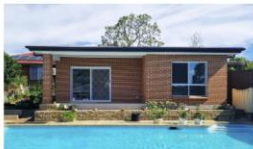
The Hills | Sydney