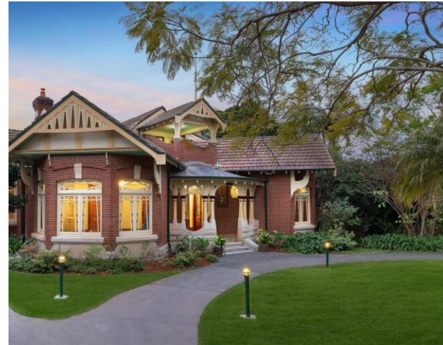
8 Roslyn Avenue Roseville 1397 sqm