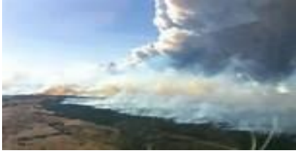
February 2017 Central West NSW Leadville-Dunedoo fire front