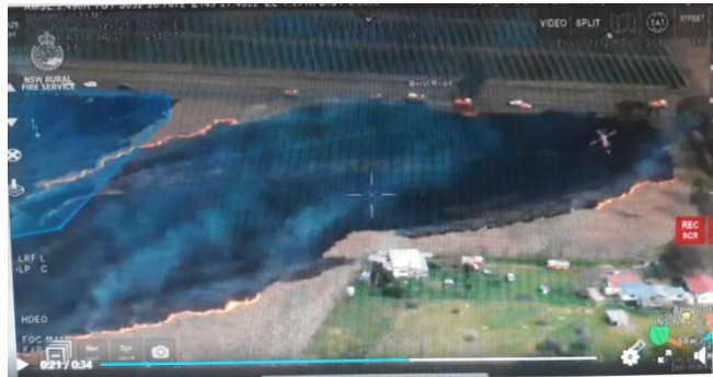
Thanks to the hard work of firefighters, supported by water bombing aircraft, the Beryl Rd Fire is now contained. It is a timely reminder that,.... Beryl grass fire (solar works at top) 26/08/2022