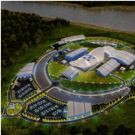
NuScale SMR requires a very small land footprint