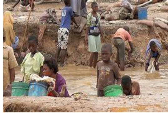
Democratic Republic of Congo: E.g. of artisanal mining of cobalt, used in batteries, destroys many African lives

A recent planning panel condition was imposed on a proposed solar works development that required a verifiable undertaking that no solar panels would be used by the developer that had any element produced by slave labour. As a moral company, we hope that the Proponent of this BESS accepts a similar condition. Assurances that they will comply with all Federal and State Modern Slavery Act laws is not sufficient.