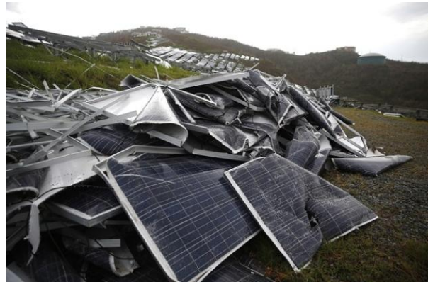
Damaged & end of life solar panels leach toxic chemicals: end up in landfill in NSW