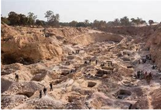
Artisanal mining for cobalt & copper