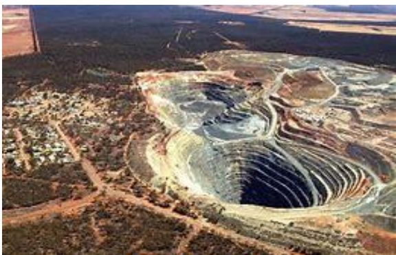
Mining lithium for batteries used in BESS