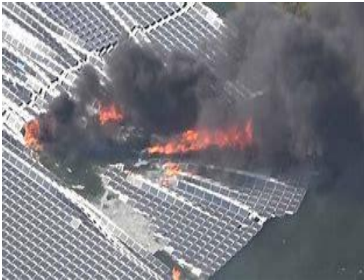
Solar works burn & the smoke is toxic