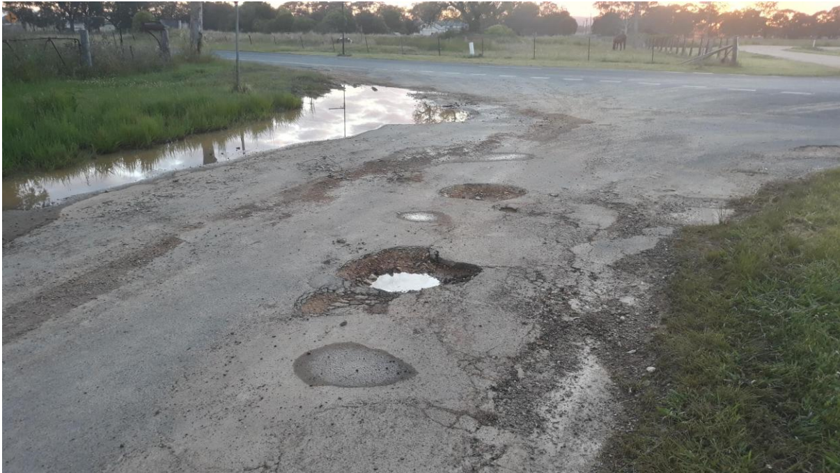
A rural road intersection with a primary road, used by heavy vehicles for building a solar/BESS works

Three significant outcomes will result from these extra heavy and light vehicle movements. Firstly, the damage to the main roads and local roads will increase significantly. Secondly, road travel times for road users will increase due to the increased number of slow moving heavy vehicles and the need for increased road works. Thirdly, the financial costs fall on the taxpayers, ratepayers and local businesses. Additional road repairs are a cost to taxpayers and rate payers with little contribution from the developers. Slower travel times will reduce the number of visitors/tourists to regional towns, especially the weekend and festival travellers, which will reduce the income of local businesses. It also impacts the time to get inputs to the farmers, businesses and manufacturers and getting produce and goods to market, so increasing the cost of food and goods.