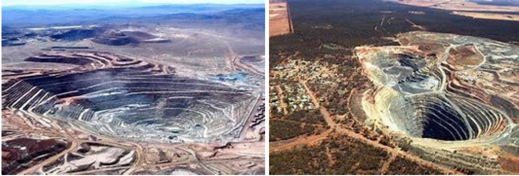
Open cut Lithium mines, many of which could swallow several regional towns in just the Central West NSW

Lithium-ion batteries require the mining of lithium, graphite, nickel, manganese, cobalt, copper, neodymium and dysprosium, as well as inputs of aluminium and steel. Large concrete bases support the BESS, so requiring more mined, processed and transported materials. Similarly, a great deal of mining is required for the other metals, some of it in previously untouched wilderness areas.