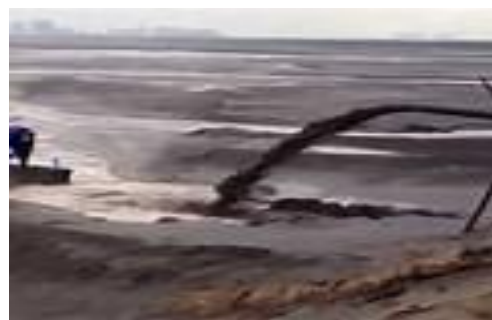
Toxic "lakes" in Baotou China from processing rare earths

The extent of increased mining, the toxic processes polluting the environments of other countries, the transport by sea and land, the clearing in regions of Australia of tracts of agricultural and bushland, the reduction of wildlife or the risk of pollution to air, land and water is staggering.