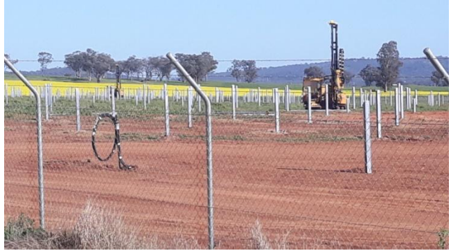
Lots of km2 of farmland stripped of surface & fenced