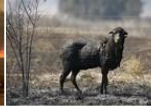
Why we hate grass fires

Almost exclusively, the renewable energy zones include mainly agricultural land and some bushland. Therefore, wind, solar and BESS works are not only constructed on such land, but are surrounded by it. Thus, a grass fire, for example, outside of a wind/solar/BESS site threatens the works and can damage it if it passes the perimeter. Burning wind/solar/BESS works are very toxic and very difficult to extinguish. As different wind/solar/BESS works can and do adjoin each other, it is possible a huge amount of capacity will be lost during a catastrophic fire like the Leadville-Dunedoo fire.