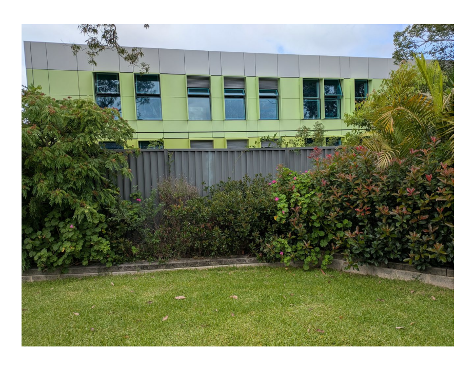
Photo5—No11 Backyard view overlooking directly to Building W