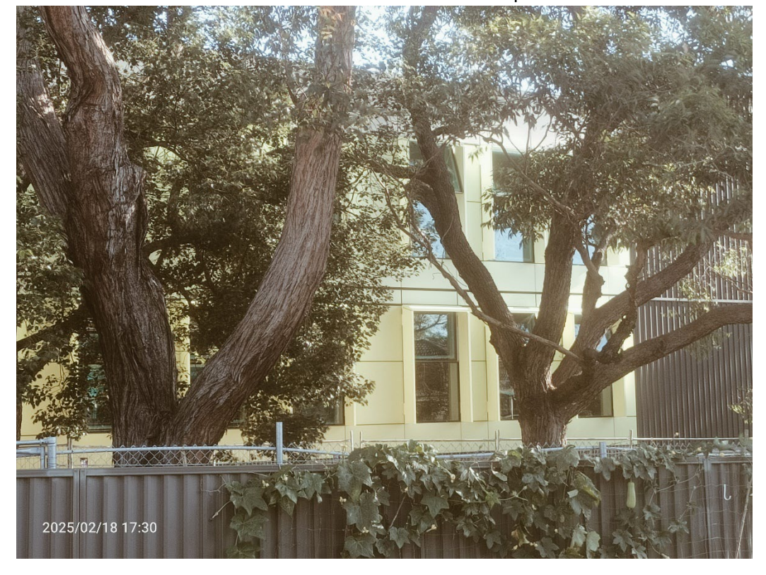
Photo 3 No.9's backyard, overlooking directly to Building W's windows.

In addition, as per the existing trees in front of building W, please refer to the photos. we are still able to overlook each other which disturbs both privacies.