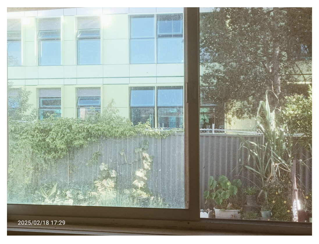
Photo 2 kitchen window view from No.9 Hilar Ave which is exposed to building W.

In addition, as per the existing trees in front of building W, please refer to the photos. we are still able to overlook each other which disturbs both privacies.