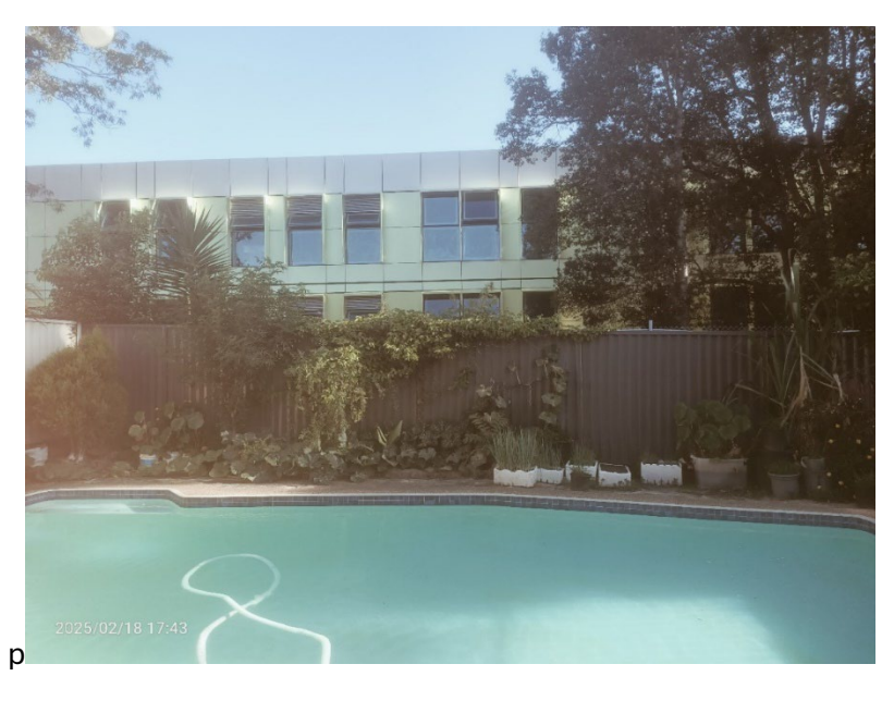
Photo 1 The swimming pool of No.9 Hilar Ave in front of Building W without sufficient privacy screen.

According to Appendix 8 – Pictorial Summary of Changes (Items No. 29 and No. 35), the modified landscape plan lacks clear details regarding the exact location and species of trees on the north side of Building W. This two-story structure, approximately 40 meters in length and 10 meters in height (including its elevated foundation), poses a significant potential for overlooking at ground level. Of particular concern is the 25-meter section between 7 and 11 Hilar Avenue, where the removal of dead tree #45 has left a gap in the privacy buffer. To effectively screen the first level of Building W, trees would need to be at least 6 meters tall requiring several years to mature and potentially lacking the canopy density needed for adequate privacy.