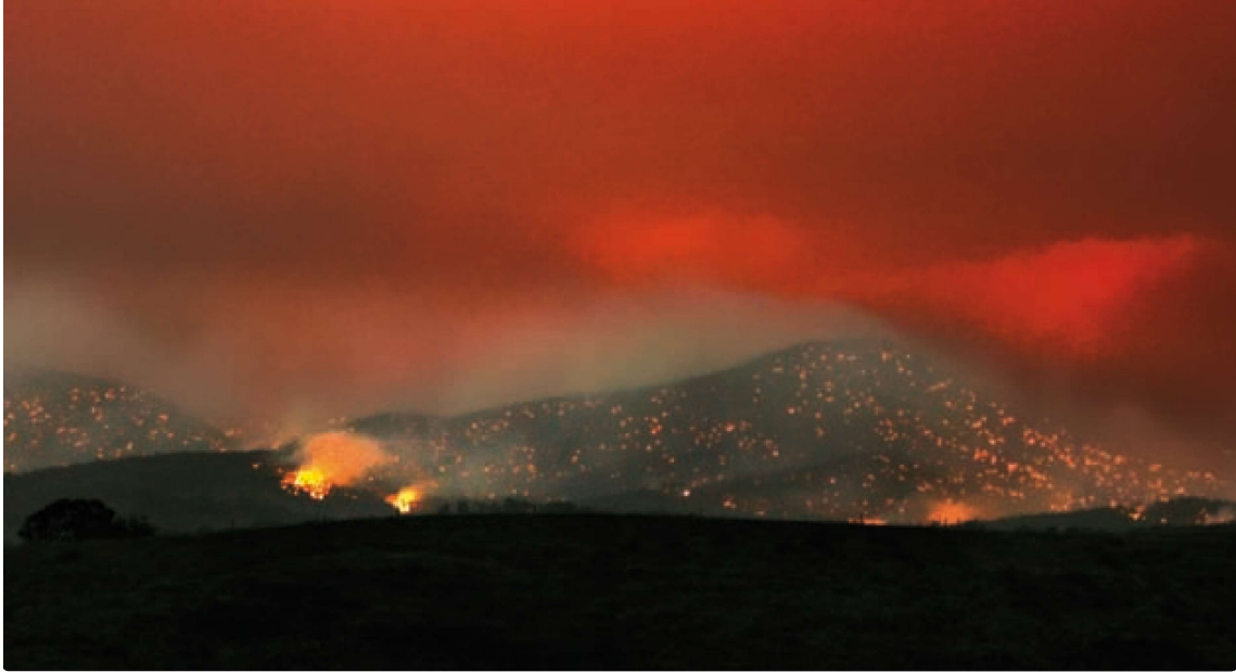
Image 3 Fires near Kinglake