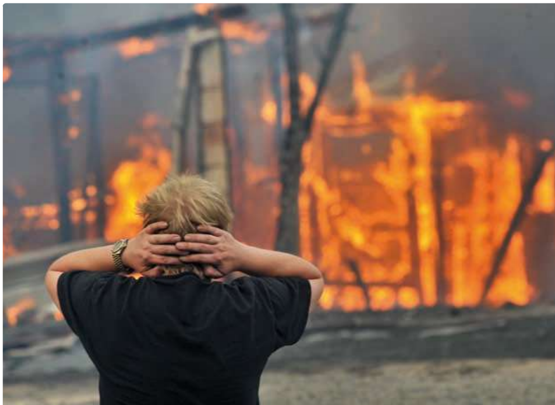
Image 2 The Bendigo fire