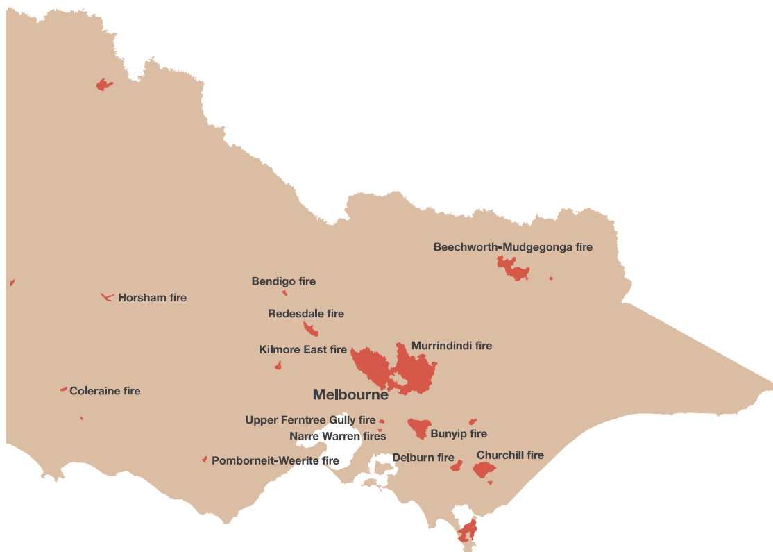
Figure 1 The January–February 2009 bushfires

Victoria has a long, sometimes devastating, history of fire. The conditions on 7 February gave rise to particularly destructive bushfires. These very intense fires share some features that set them apart from less intense fires. Very dry fuels and strong surface winds resulted in erratic fire behaviour and the development of strong convective activity capable of lifting firebrands such as burning bark high in the convection column. Strong upper air winds transported burning bark downwind for many kilometres, resulting in long-distance fire spotting.