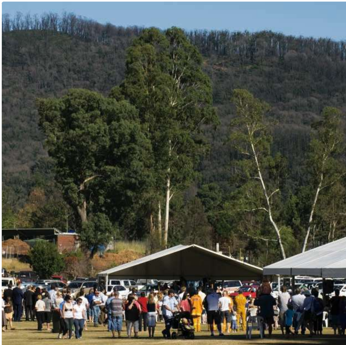
Image 5 Marysville gathers to remember Black Saturday