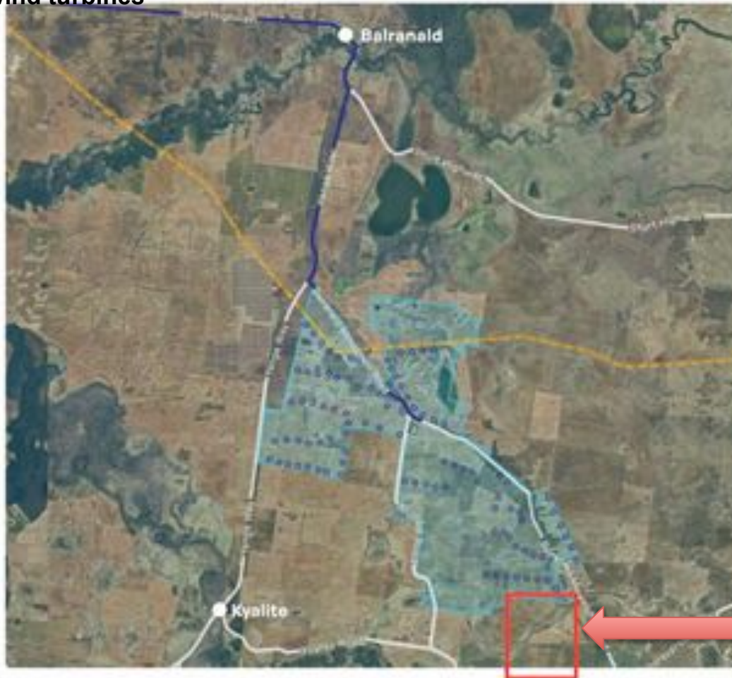
Photo 1: Map emailed from WindLab of proposed locations of wind turbines