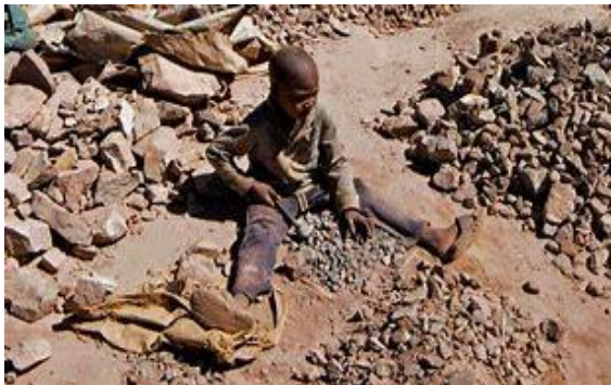
Child slave labour used in DRC