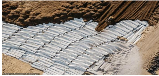
Is this the fate of all discarded turbine blades?

# The February 2017 Leadville-Dunedoo fire destroyed 35 homes, killed 6000 livestock & burnt 500km 2 of bush and grassland in one day. Grass fires are frequent occurrences in the regions, especially during periods of drought. While this fire was not started by a non-fossil fuel electricity plant, such plants may start grass/bush fires or be vulnerable to such fires in the future.