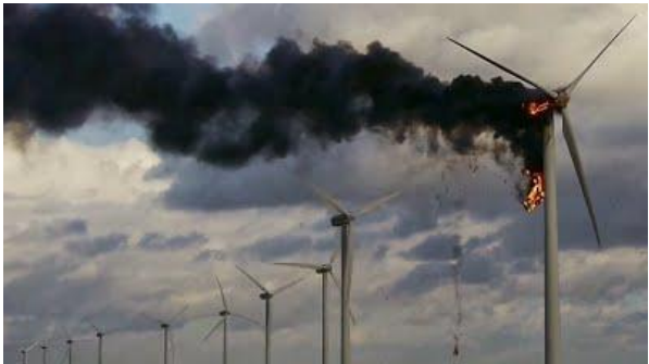
Burning turbines create toxic smoke