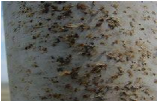
Insect encrusted turbine blade attracts bats & birds