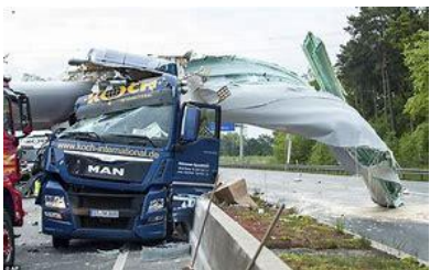
Accidents may occur