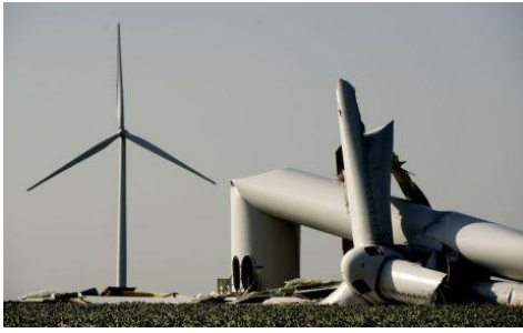
Turbines can fail catastrophically