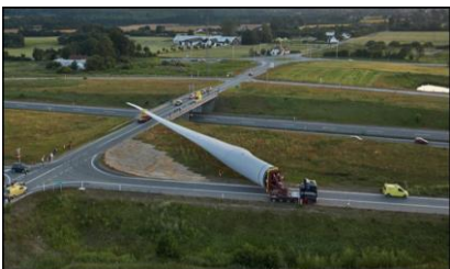
Traffic disruption (e.g. blade movement)