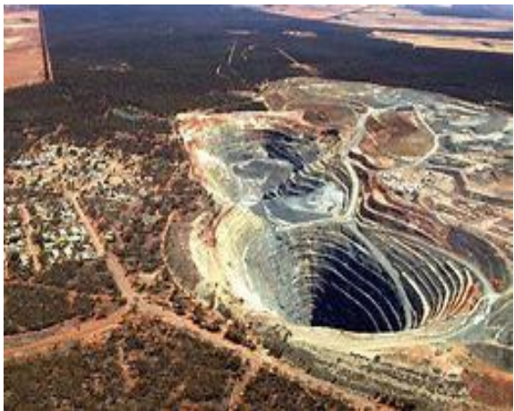
Lithium mining could swallow many regional towns