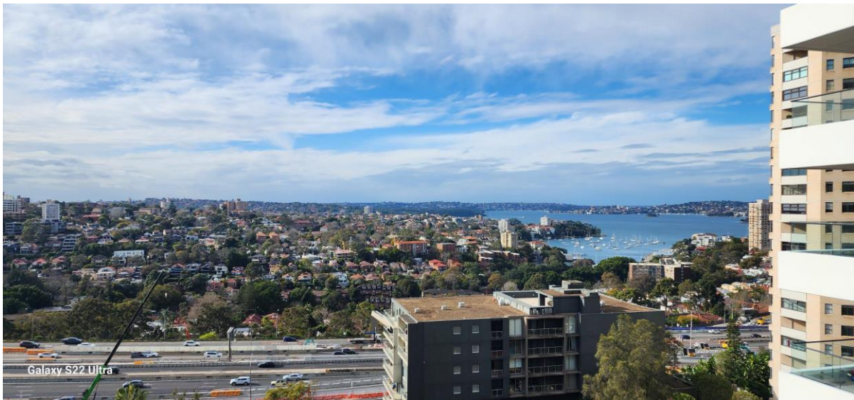
Views from unit 1110