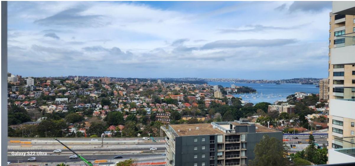
View from unit 1210

The above list of apartments on four floors amount to 24 dwellings that are directly and substantially impacted by the loss of views due to the height of the proposed Building Three of the project.