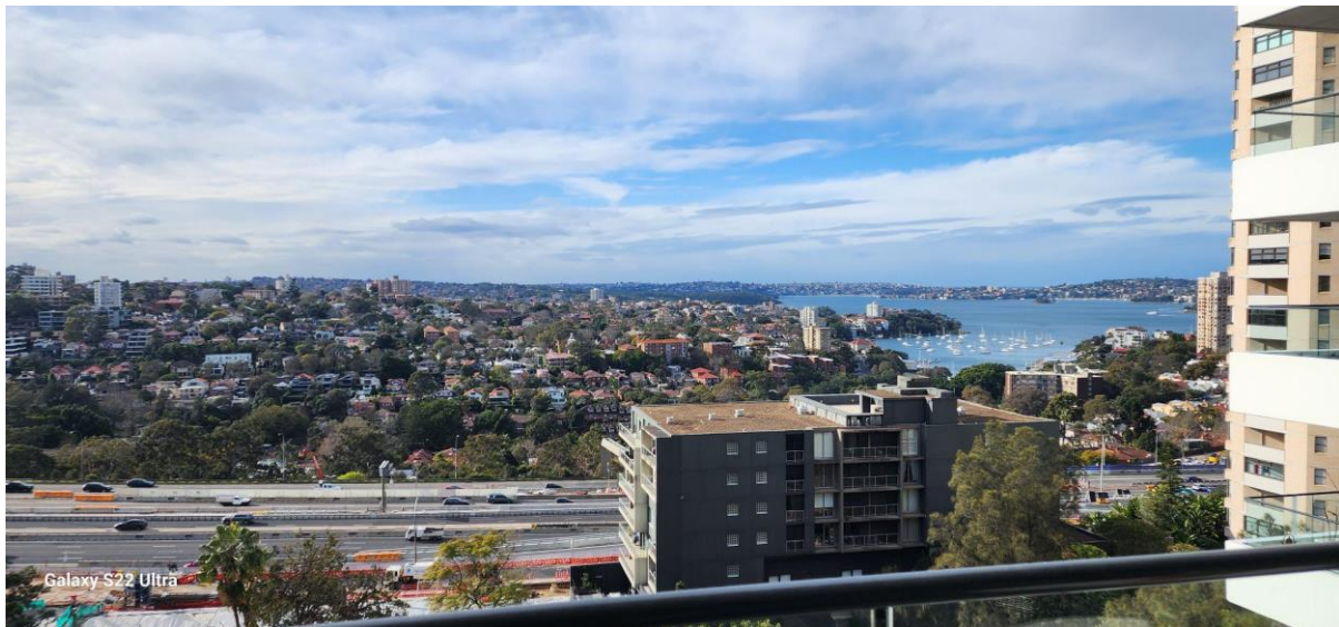
Views from unit 1010

The above images were photographed by the writer on 29 th July 2024, taken from the same position on every apartment of the large three-bedroom configuration. These are the harbour views that will be lost to every one of the 24 apartments.