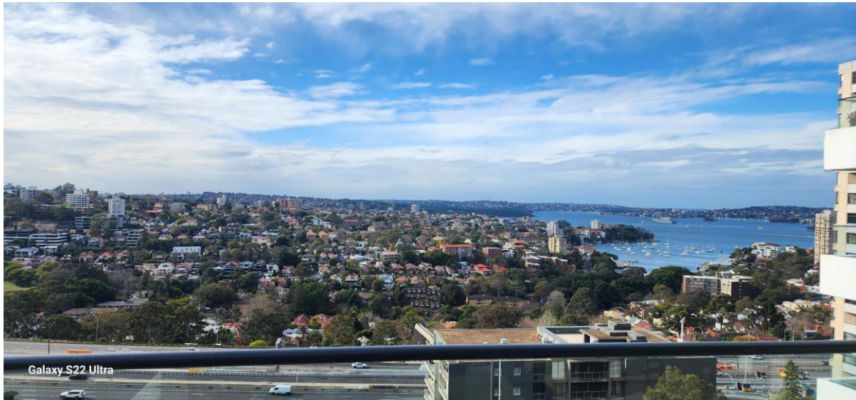
Views from unit 1310