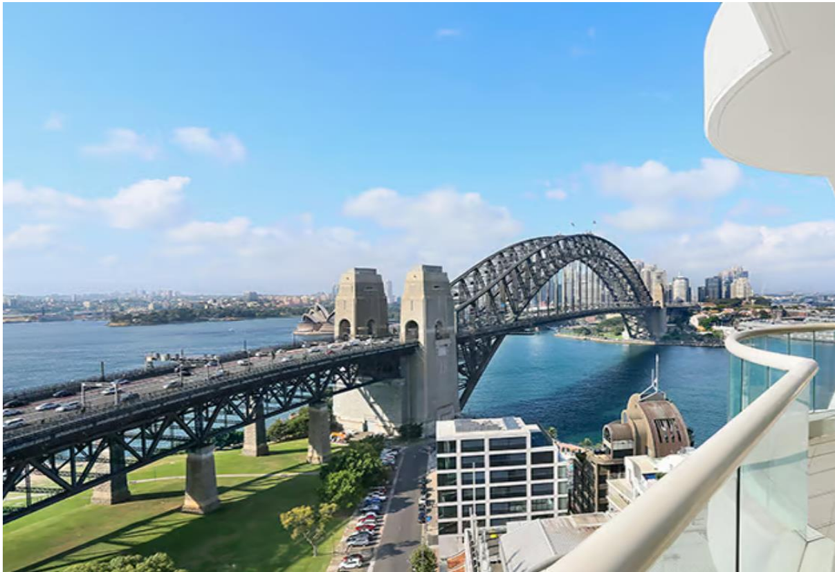
Iconic Views from an apartment at 38 Alfred Street, North Sydney.