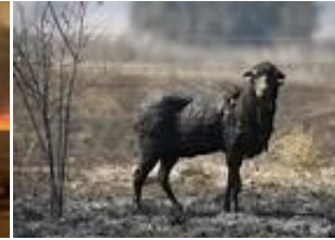
Why we hate grass fires

Almost exclusively, the renewable energy zones include mainly agricultural land and some bushland. Therefore, wind, solar and BESS works are not only constructed on such land, but are surrounded by it. Thus, a grass fire, for example, outside of a wind/solar/BESS site threatens the works and can damage it if it passes the perimeter. Burning wind/solar/BESS works are very toxic and very difficult to extinguish. As different wind/solar/BESS works can and do adjoin each other, it is possible a huge amount of capacity will be lost during a catastrophic fire like the Leadville-Dunedoo fire.