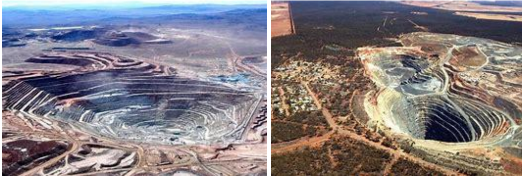
Open cut Lithium mines, many of which could swallow several regional towns in just the Central West NSW

For example, a Tesla utility scale power pack weighs 2199kg and contains about 45kg of lithium, which equates to mining 3,475,000 tonnes of ore per power pack . Lithium batteries used in a BESS weigh many tonnes. A 200MWh battery weighs over 4,800 tonnes and so contains 98,000 kgs of lithium, which involved mining a staggering 7,568 million tonnes of ore.