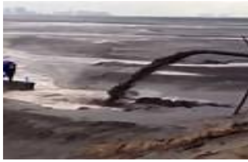
Toxic "lakes" in Baotou China from processing rare earths

The extent of increased mining, the toxic processes polluting the environments of other countries, the transport by sea and land, the clearing in regions of Australia of tracts of agricultural and bushland, the reduction of wildlife or the risk of pollution to air, land and water is staggering.