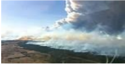
February 2017 Central West NSW Leadville-Dunedoo fire front

With limited road access and access to water it is extremely difficult to contain a grass fire in dry hot and windy conditions. The high fencing surrounding solar works and the 250 metre plus tall wind turbines add significantly to the risks faced by the local communities. Access by road and air is much more limited. The existing, approved and in planning developments will, if all built, cover hundreds of km 2 of land within a 20km radius of Gulgong. This additional risk applies to all towns with such wind/solar/BESS developments so close to their properties and towns.