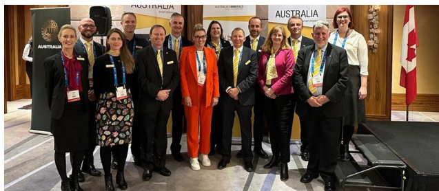
Prospectors and Developers Association of Canada Conference 2023 - Australian Minerals delegation