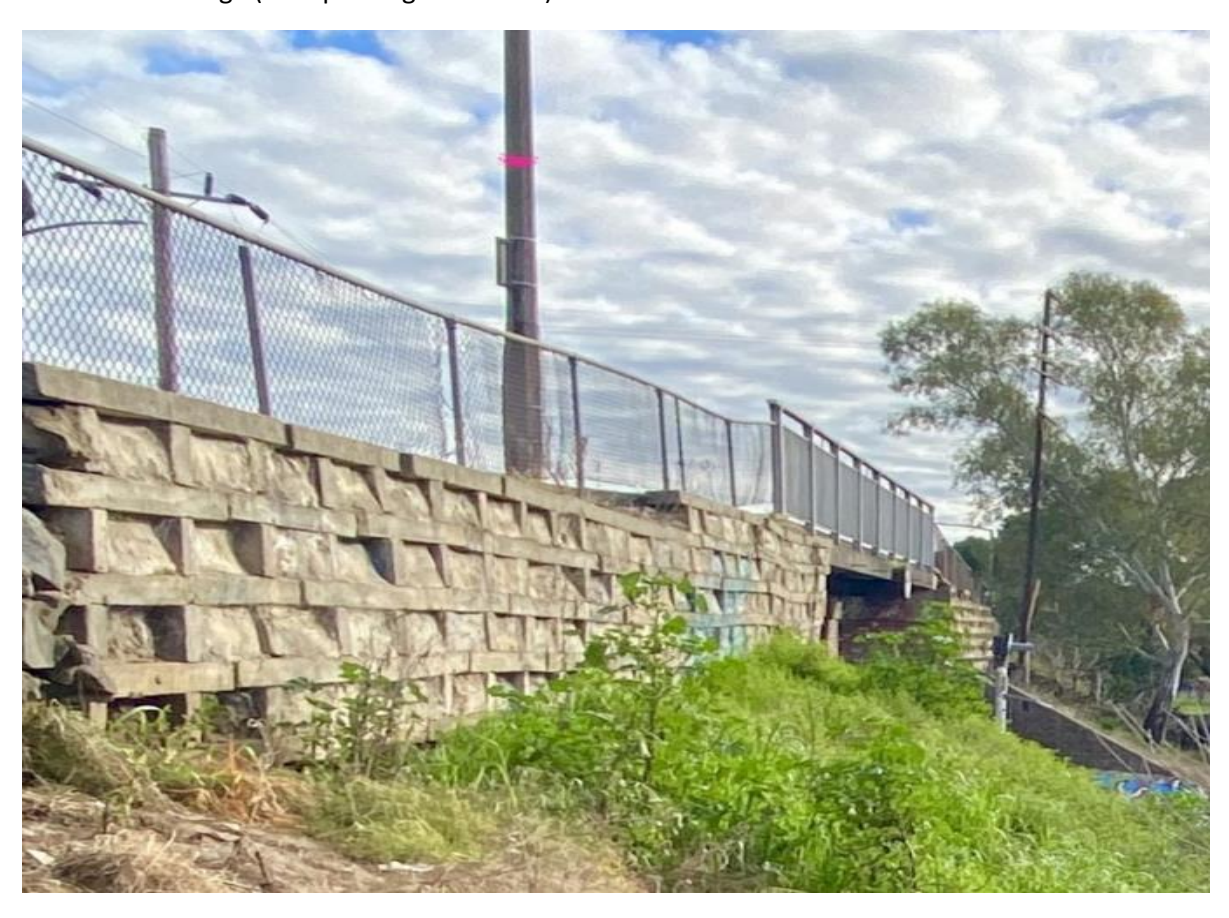
Inland Rail Alternate Route around Wagga CBD:

Edmondson Bridge (with pink high indicator):