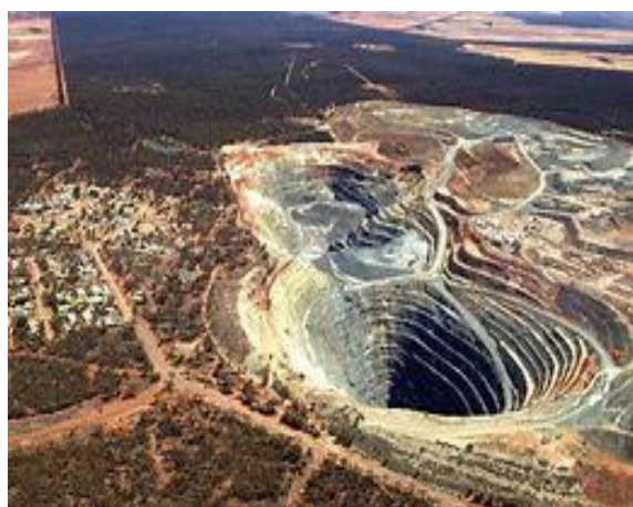
Lithium mining could swallow many regional towns