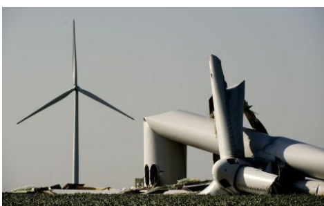
Turbines can fail catastrophically