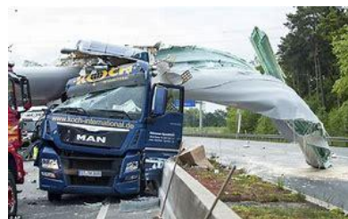
Accidents may occur