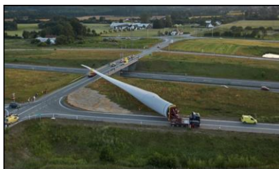
Traffic disruption (e.g. blade movement)