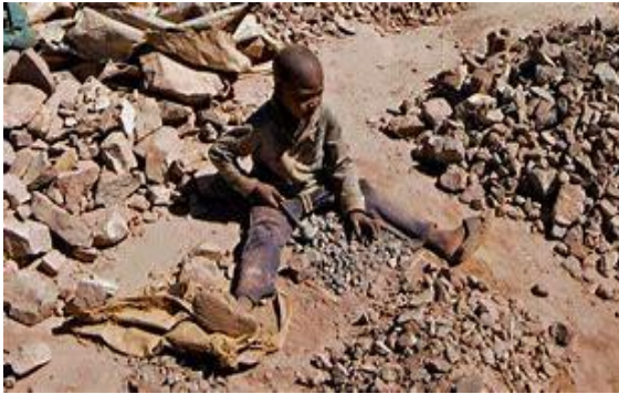
Child slave labour used in DRC