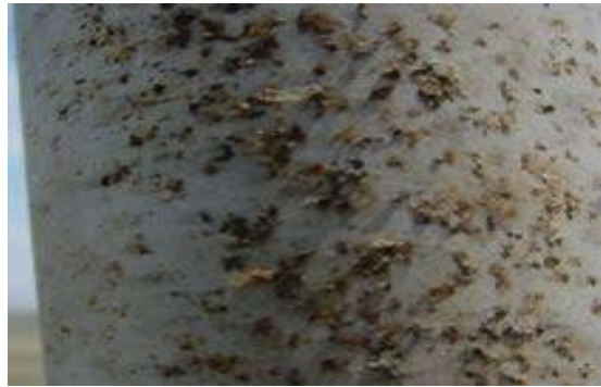
Insect encrusted turbine blade attracts bats & birds