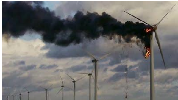
Burning turbines create toxic smoke