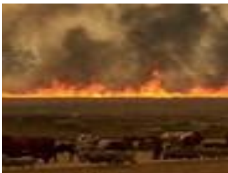
55,000ha Leadville fire 2/17#