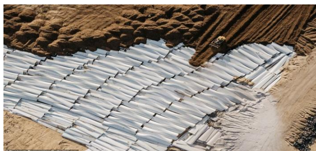
Is this the fate of all discarded turbine blades?

# The February 2017 Leadville-Dunedoo fire destroyed 35 homes, killed 6000 livestock & burnt 500km 2 of bush and grassland in one day. Grass fires are frequent occurrences in the region, especially during periods of drought. While this fire was not started by a non-fossil fuel electricity plant, such plants may start grass/bush fires or be vulnerable to such fires in the future.