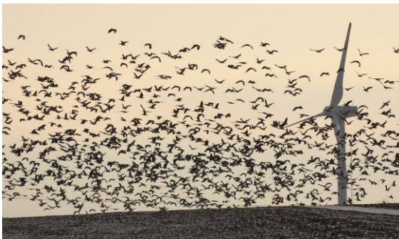
Bird and bats at risk when in flight