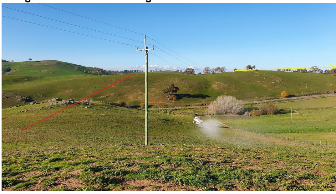
RED LINE - re-alignment narrow crossing over Black Range Road.. <u>ALL WITHIN THE ORIGINAL CORRIDOR</u>

YELLOW LINE 500kv Line— Large span and BEND IN LINE, rock escarpment, sloping ground to LIVESTOCK YARDS,