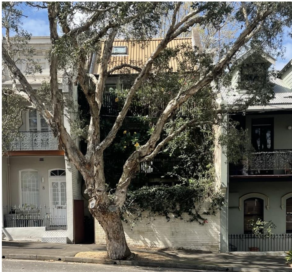
10 Alexander St in 2023

By no measure is Paddington, south of Oxford St, an entertainment precinct. There are just two pubs and no bars or restaurants in Moore Park Rd, and none in Cook and Lang Rds, Centennial Park.