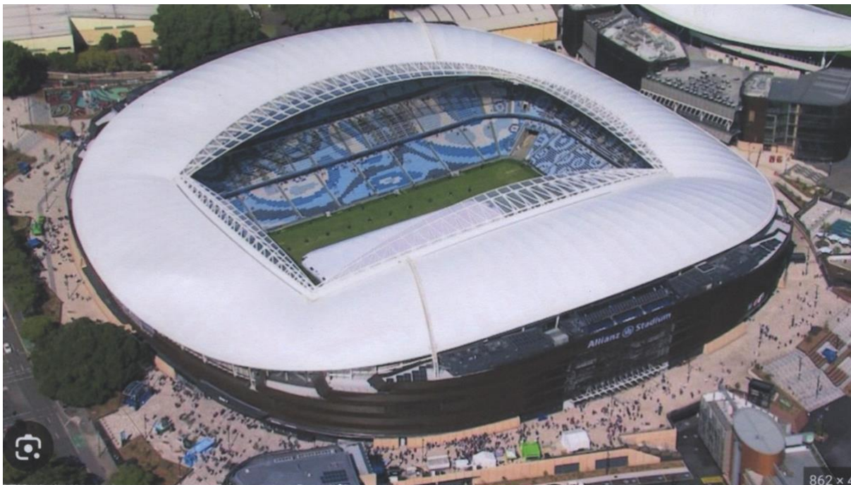
The second ALLIANZ STADIUM opened in 2022.