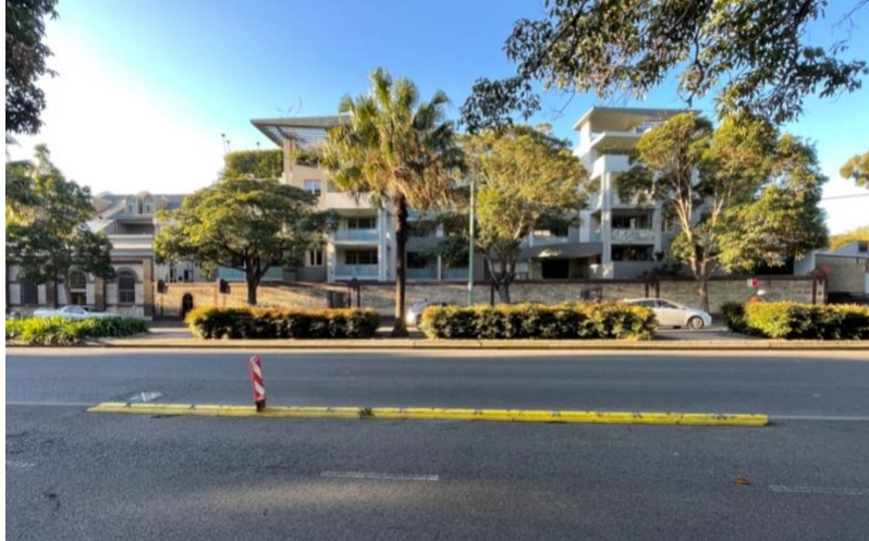
Moore Park Road