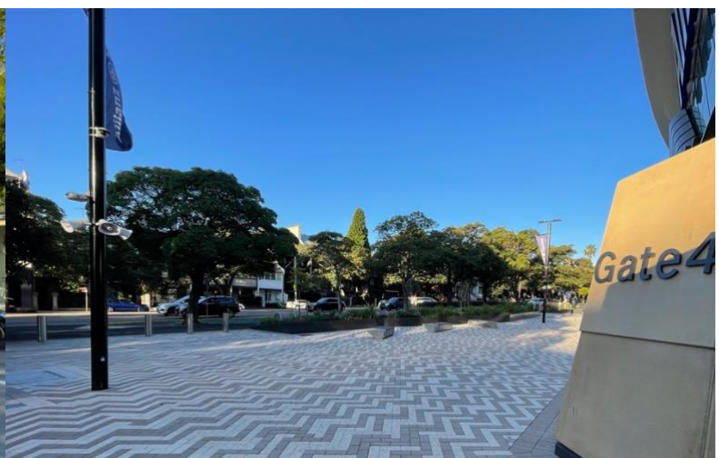
Moore Park Road