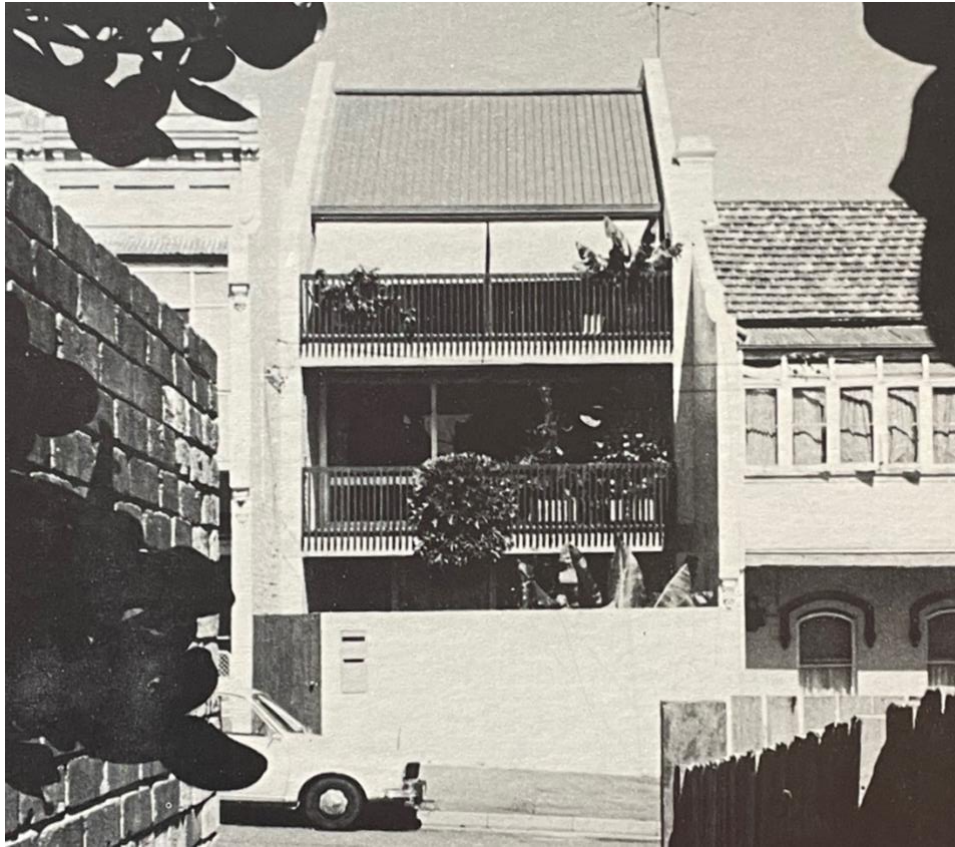
10 Alexander St in 1973.

By no measure is Paddington, south of Oxford St, an entertainment precinct. There are just two pubs and no bars or restaurants in Moore Park Rd, and none in Cook and Lang Rds, Centennial Park.