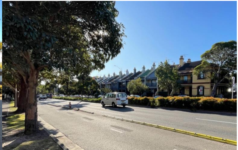
Moore Park Road