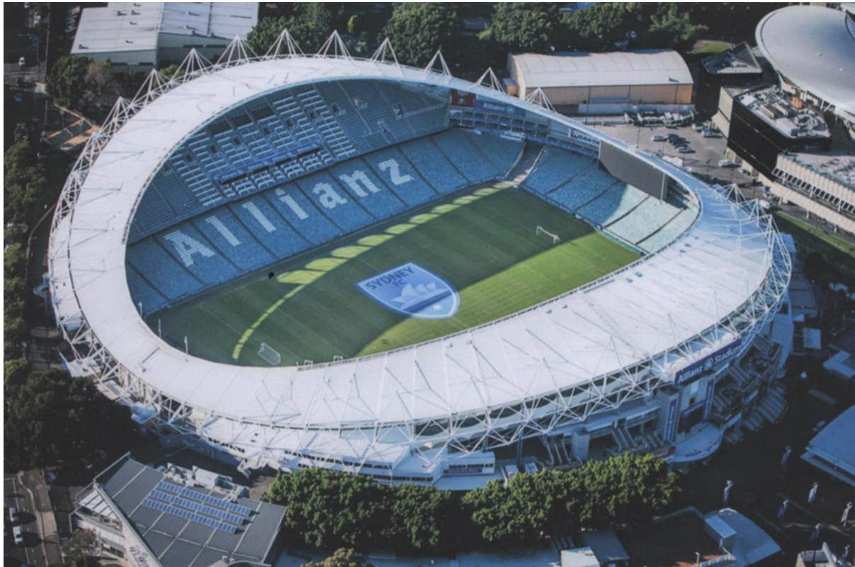
The first ALLIANZ STADIUM (above), opened in 1988 was demolished in 2018 following a disingenuous campaign by the Sydney Cricket Ground Trust that it was unsafe, although an internal report said that only $18m was necessary to upgrade the building for regulatory compliance. The cost of the new building was $828m and its demolition strongly opposed by the Labour Opposition.