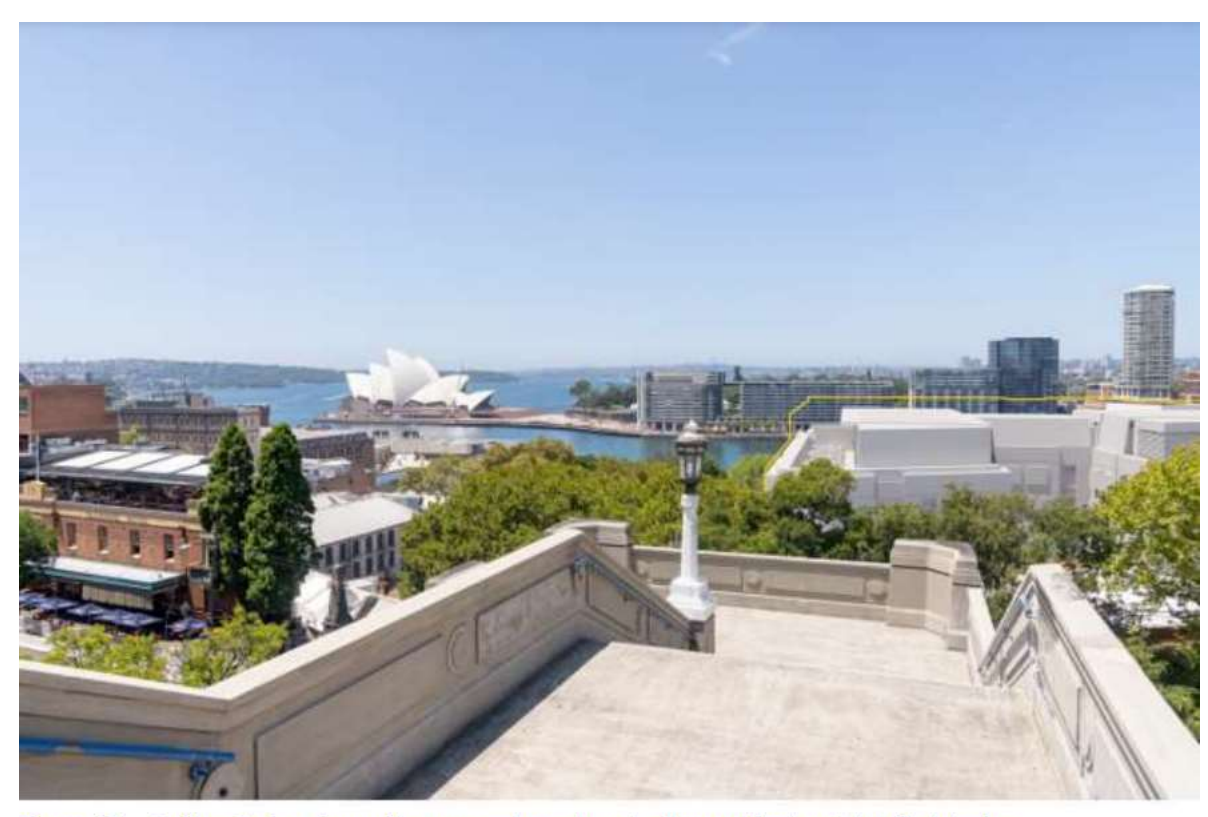
Figure 43 Bridge Stairs- view with proposed envelope (yellow outline) and detailed design