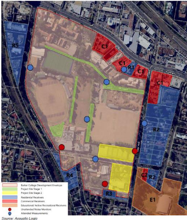
Figure 3: Predicted construction noise generation to E1