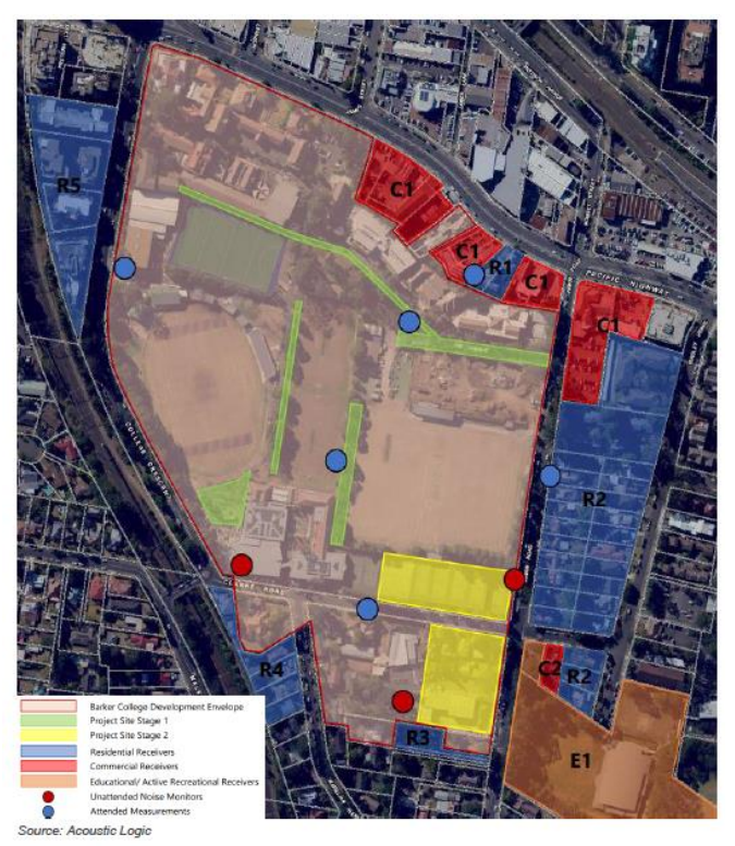
Figure 3: Predicted construction noise generation to E1