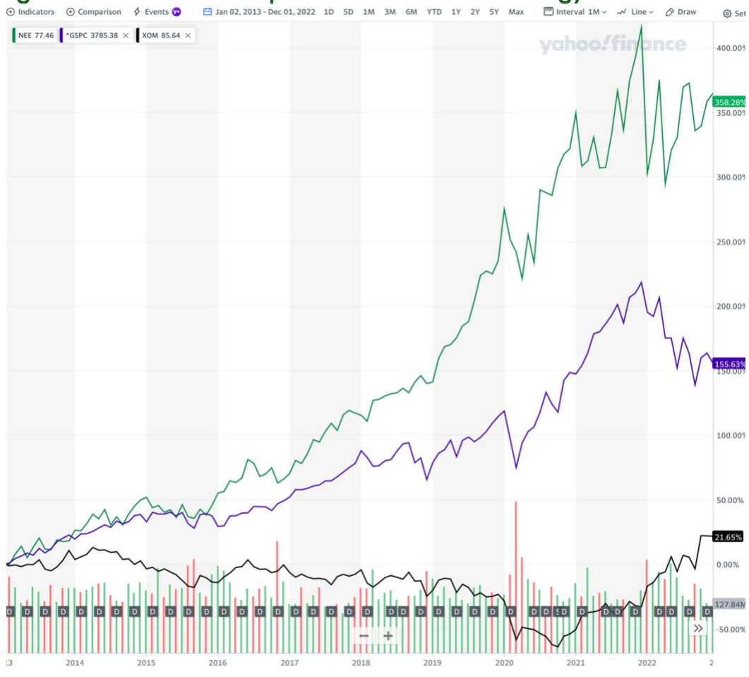
Figure 3: The Sustained Outperformance of NextEra Energy vs ExxonMobil

Figure 3 highlights why finance has started to respond to what I see as the combined moral, financial and policy pressures – it is all to do with massive fossil fuel wealth destruction over the last decade. Nextera Energy (in green, up fourfold) is the largest investor in renewable energy in the world, and Exxon (in black, up just 22% in the past decade) one of the largest fossil fuel firms. Fund managers have voted with their investments. Purple is the US equity market index (up 156%), for comparison.