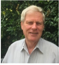
Bushfire Planning & Protection Consultant 2020