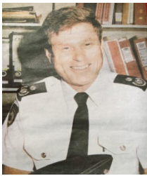
Fire Control Officer, Wyong Shire NSW 1994