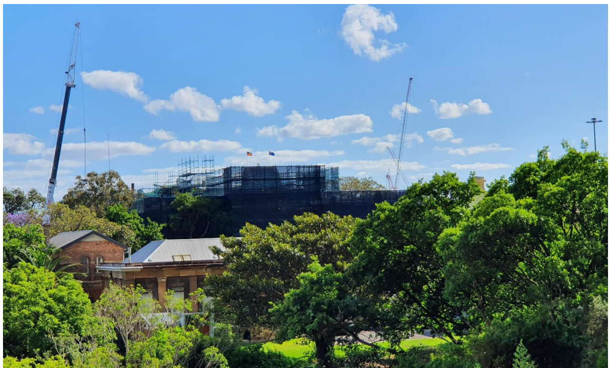
Current site with Kent St views lost

https://pp.planningportal.nsw.gov.au/major-projects/projects/fort-street-public-school-modification-2-design-changes