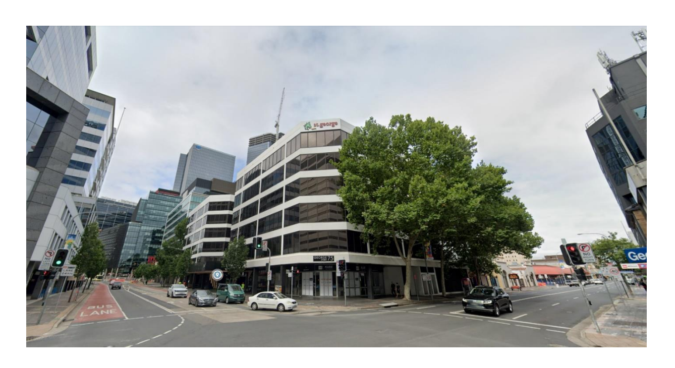
Figure 2 75 George Street, looking south-east from the intersection of George Street and Smith Street