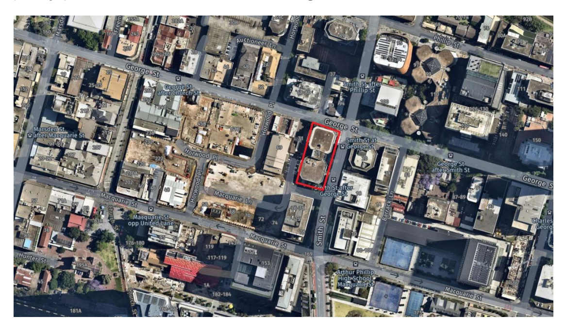
Figure 1 Site aerial (site outlined in red)

The site has frontages of approximately 35m to George Street and 75m to Smith Street and comprises a 6-storey commercial building (with shared core) and ground floor retail. Pedestrian and vehicular access to the building is provided from Smith Street. The building has provision for 105 above-ground car parking spaces. The location of the site is shown in Figure 1.