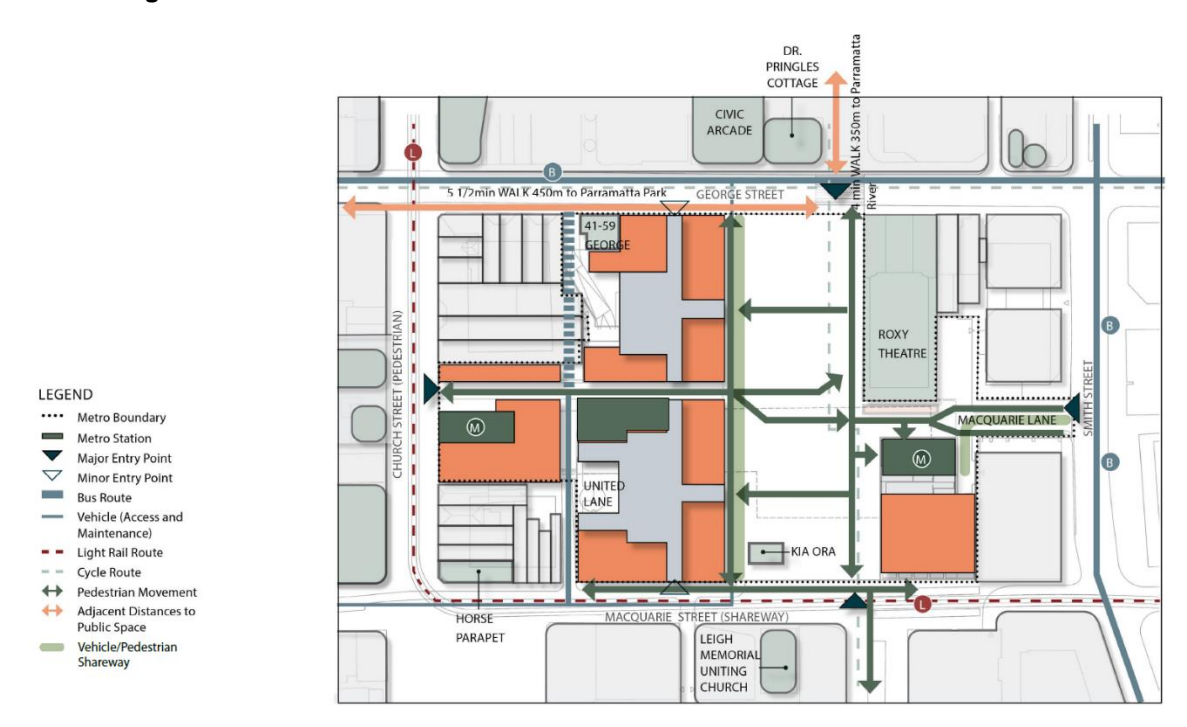
Figure 5 EIS Appendix E Public Domain Access and Circulation diagram (pg. 156)

Mirvac also notes from the EIS Appendix E (Built Form and Urban Design Report) that Macquarie Lane is proposed to be a 'shared lane' providing both pedestrian and vehicular access to the Metro Site, as shown in Figure 5 .