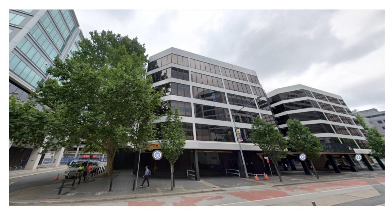
Figure 3 75 George Street, looking east from Smith Street (Macquarie Lane shown left, existing vehicular access shown in middle from Smith Street)