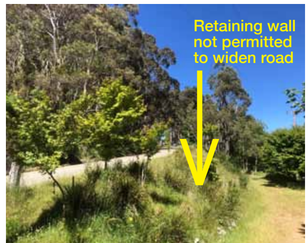
Morrisons Gap Rd - corner above NAD_12 view to north