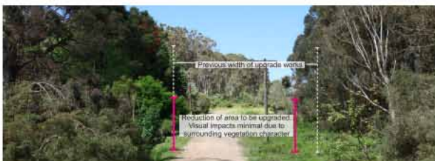
Image 03. View of Morrisons Gap Road near NAD_15 AD_15

Due to a reduction in upgrade area and scope of work, the potential visual impacts are likely to be low. Images 03 and 04 show the existing character of Morrisons Gap Road and the likely impacts of the upgrade.