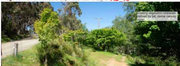
Image 04. View of Morrisons Gap Road HILLS OF GOLD WIND FARM | LANDSCAPE & VISUAL IMPACT ASSESSMENT ADDENDUM