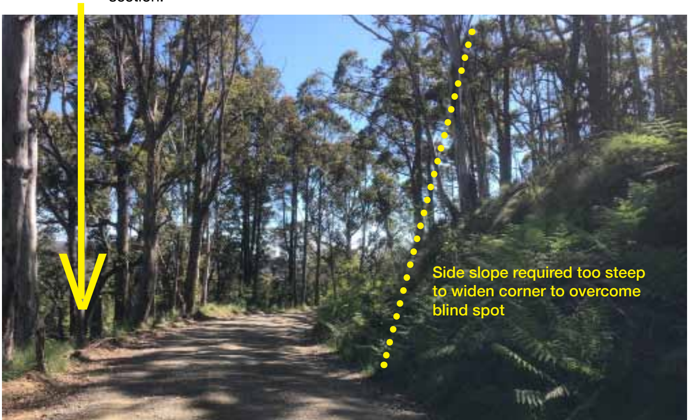
Morrisons Gap Rd - Corner above NAD_12 - view to south