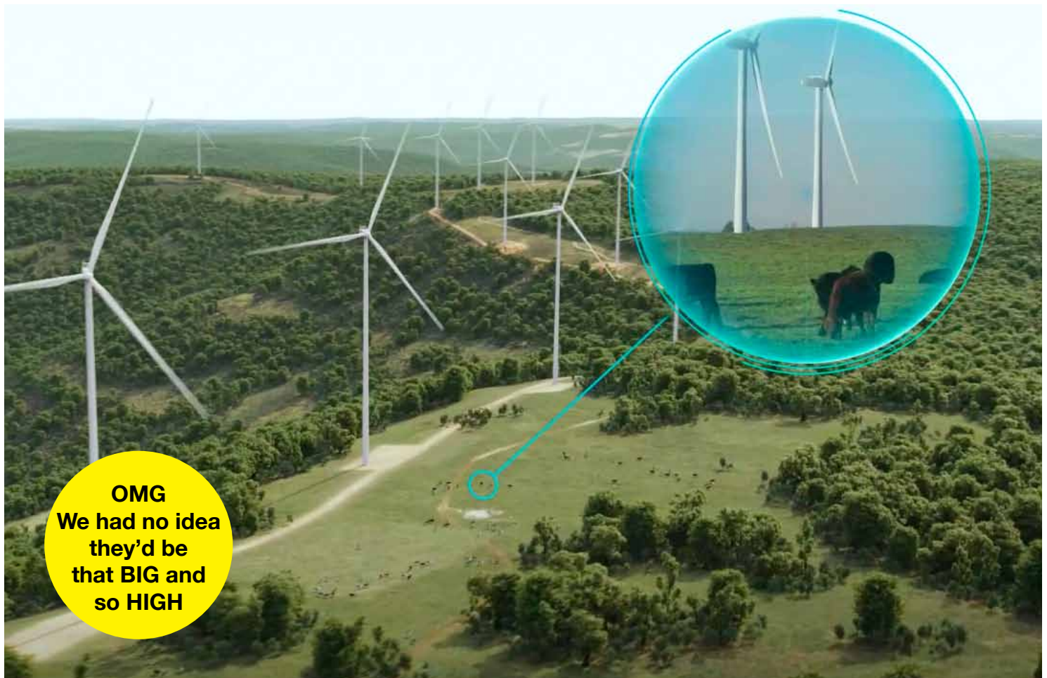
Above: still shot from the 03:05 video on the engie website promoting the HoGWF Below: screen shot of the video at engie.com.au/home/assets/wind/hills-of-gold

As the Proponent readily concedes, a certain degree of visual impact is part and parcel of all wind farms, but with a project like this along a ridge line, and because of the number of turbines and the turbine height relative to the height of the ridge, no amount of visual screening can avoid the industrialisation of the skyline.