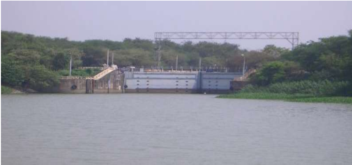
FIG-1: LOCK GATE ON THE FARAKKA