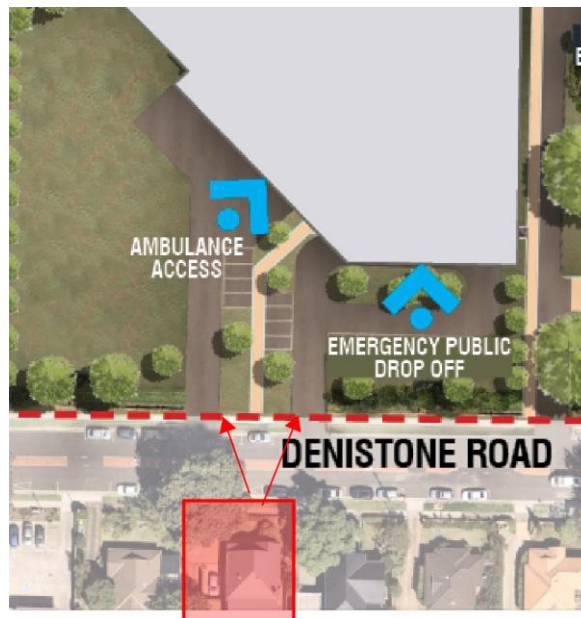
Figure 1: Location of my residence to emergency hospital entrance