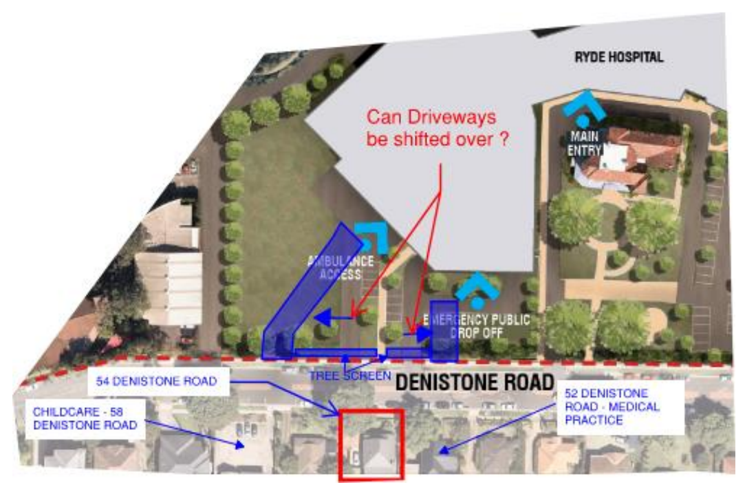
Figure 2: Suggested Alternatives

I look forward to hearing from you and hope you consider my concerns of the Ryde Hospital redevelopment through implementation of mitigations and/or design changes to address the above.