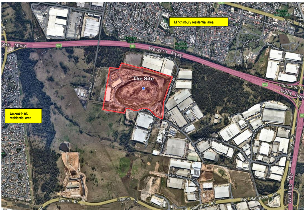
Figure 1 Site Context and Surrounding Area

Specifically, Lendlease has a landholding to the south-east of the Site. It is noted that the land comprises an existing warehouses/industrial facility that is currently in operation.