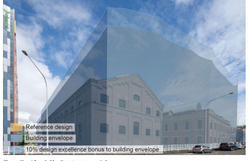
igure 21 View 2: Pier Street – propose

The scope of the SSDA appears to have increased and differs from the public consultation webinar provided by Ethos Urban with regards the proposed view from Pier Street: