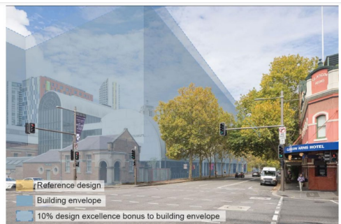
Figure 19 View 1: Harris

With reference to other visualisations provided in the SSDA: