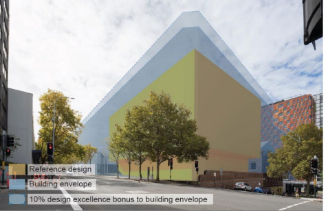
Figure 27 View 5: Harris Street and Macarthur Street – proposed view