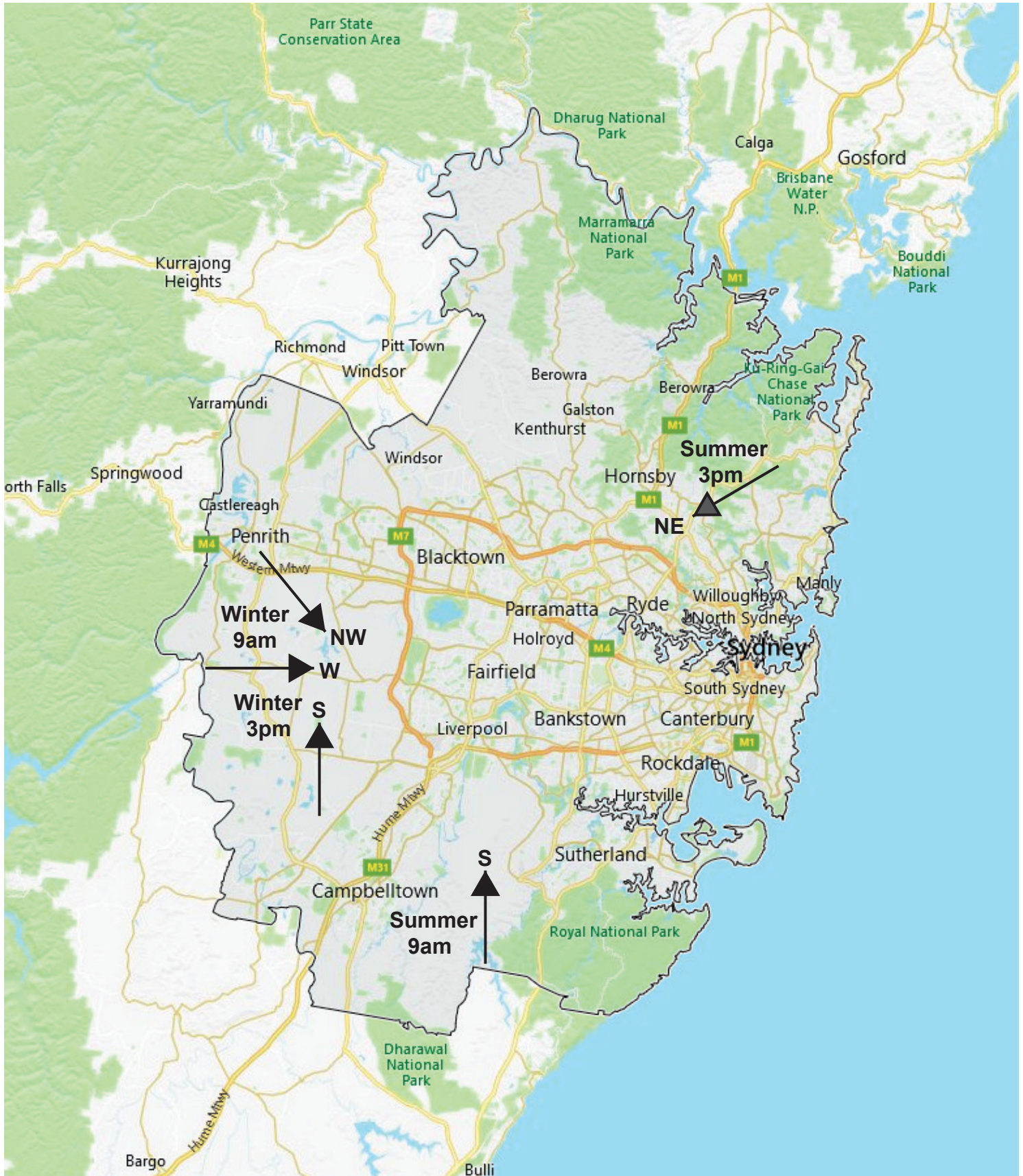
Figure 1: Greater Sydney area showing typical summer and winter morning and afternoon wind directions.