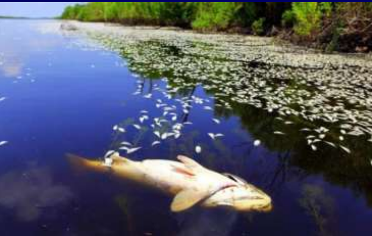
Fish killed by heavy metal pollution, Nigeria