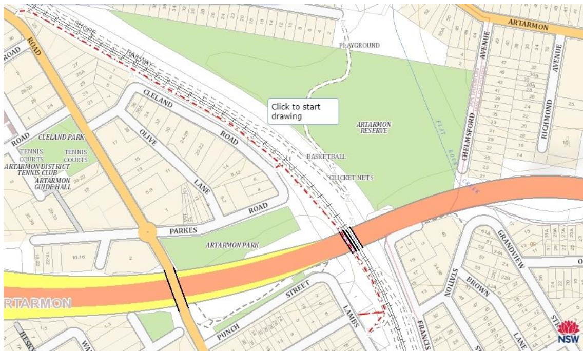
Map #2: Suggested shared path along rail corridor

Since this is a Transport NSW project and they include Sydney Trains you might like to put a shared pathway along the east side of the rail corridor from "37" Hampden Rd to "-1" Lambs Rd shown below (Map #2: Suggested shared path along rail corridor)