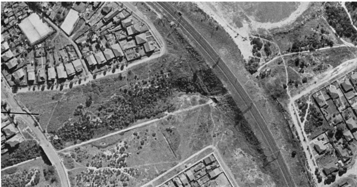
Map #3: circa 1943 aerial image

There is a historic tunnel still there which the storm water runs through, see image below (Map #3: circa 1943 aerial image). Obviously, you will need to be doing some work in this area as this tunnel is between the planned new road tunnel and Gore Hill Freeway. This storm water tunnel could be made into a pedestrian tunnel like the storm water tunnel under Willoughby Rd further downstream.