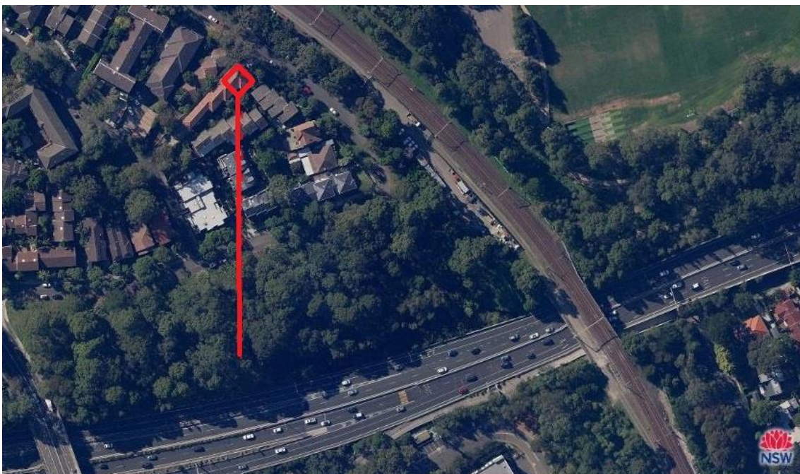
Map #1: Location of my unit

I live approximately 150 metres due north of the Artarmon east bound tunnel entry at 14 Cleland Road Artarmon. My unit (#1) is at the front of the block and faces the rail corridor in a development of 8 units. I have lived here for the last 24 years. (Map #1: Location of my unit)