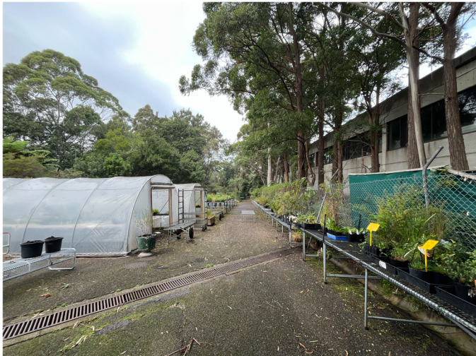
Photo 5 - Nursery seedlings