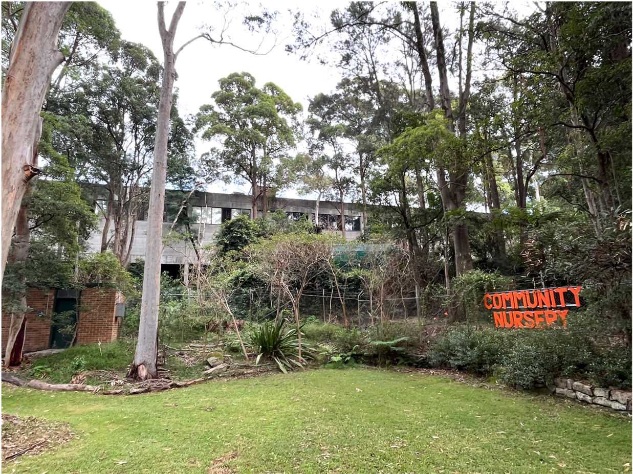
Photo 1 - Nursery entrance from Lloyd Rees Drive showing Site adjoining its western boundary