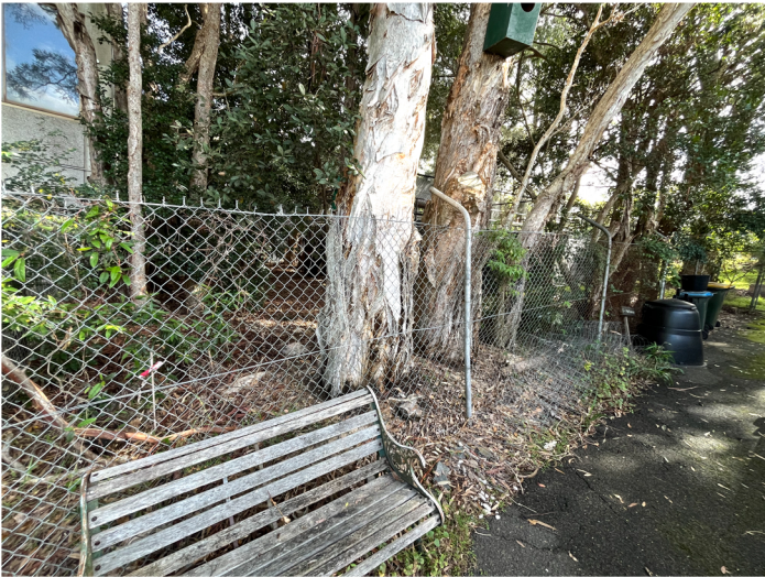
Photo 11 - Mid upper western boundary to Site, note fauna nesting box in tree