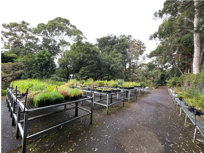
Photo 3 - Nursery seedlings