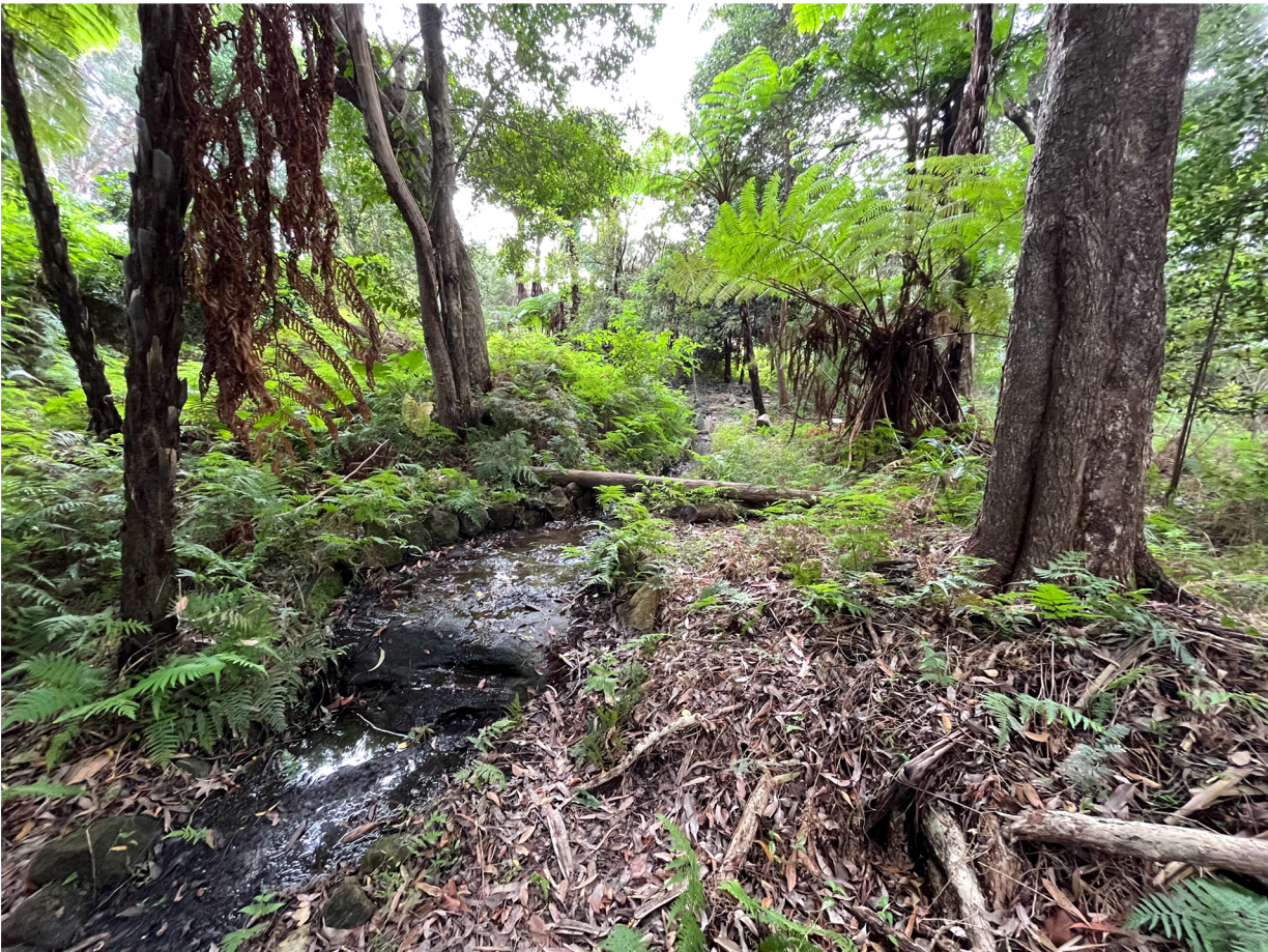
Photo 8 - Nursery conservation area - note creek