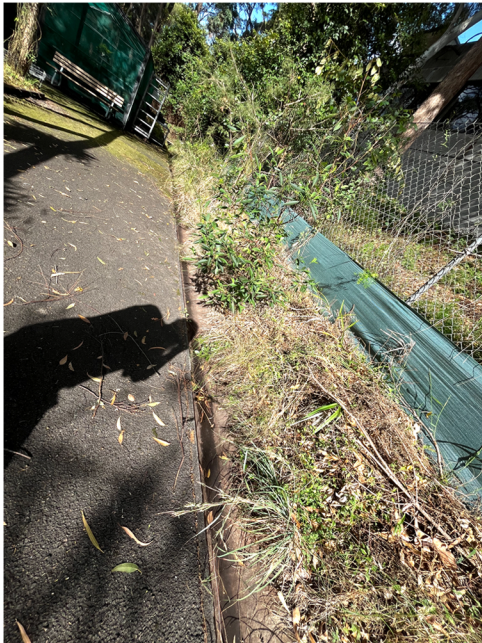
Photo 12 & 13 - Large drainage open pipe bordering the Nursery and Site