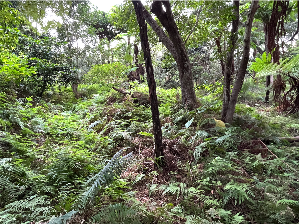
Photo 7 - Nursery conservation area