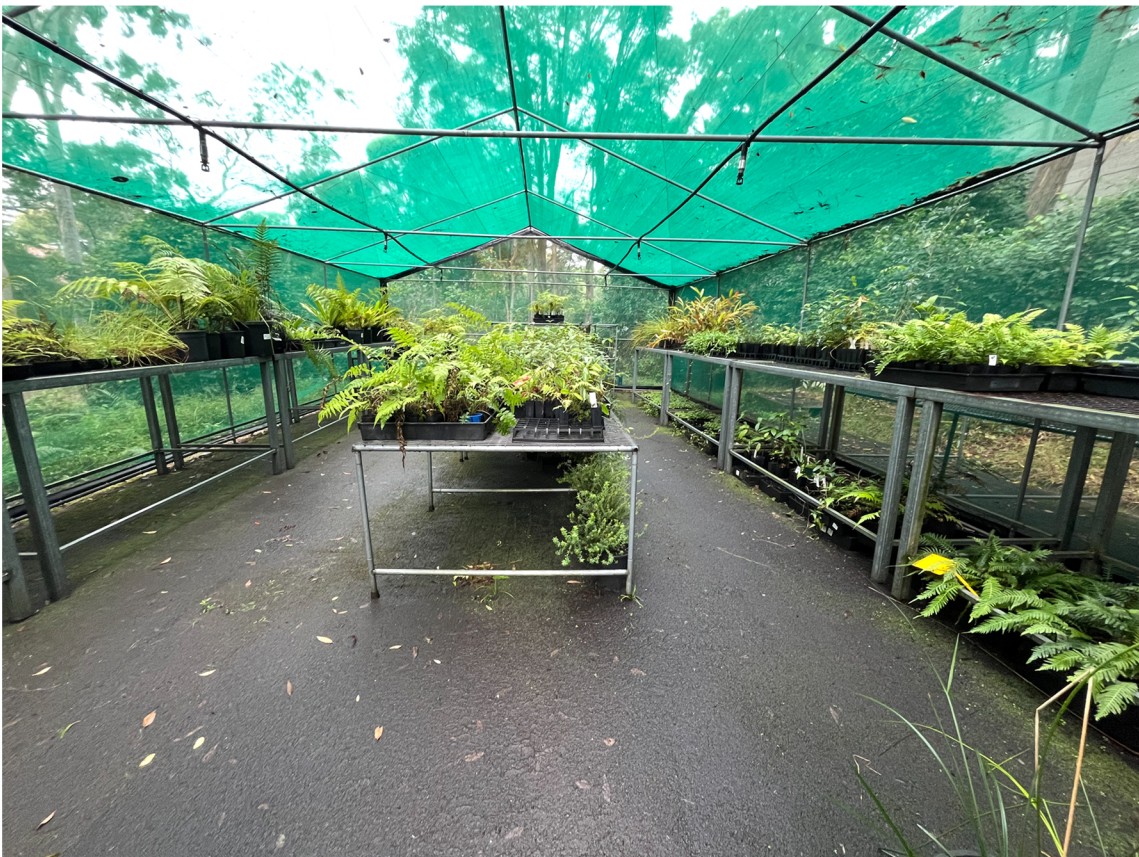
Photo 10 - Nursery seedlings