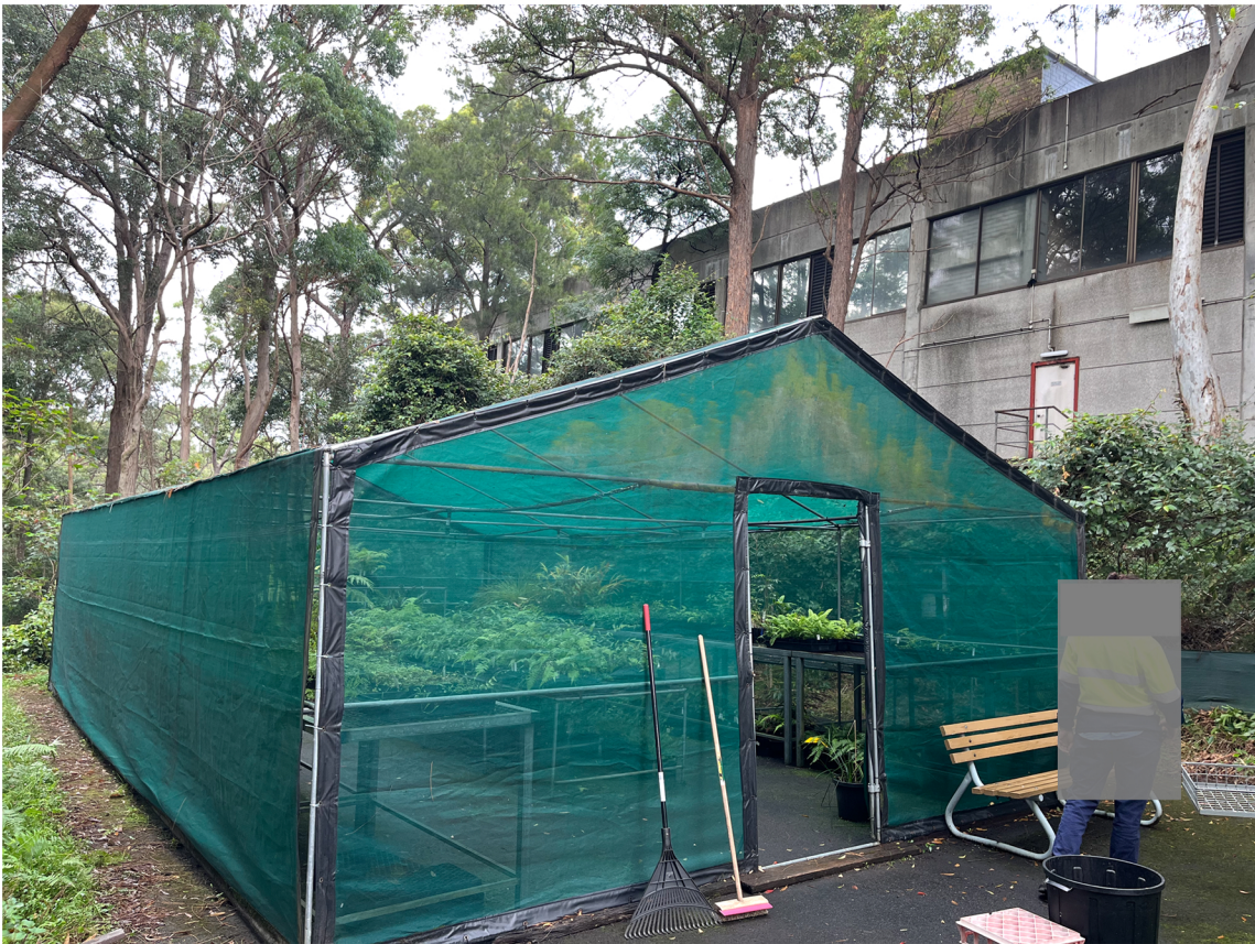
Photo 9 - Nursery seedlings