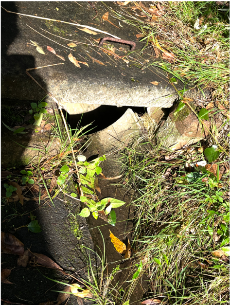
Photo 14 - Most likely Stormwater pit at end of the pipe pictured in Photo 12 & 13