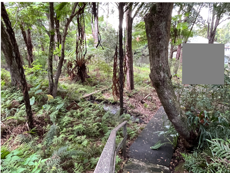
Photo 7 - Nursery steps lead down to nature area, with wet forest style landscape with creek in middle of picture