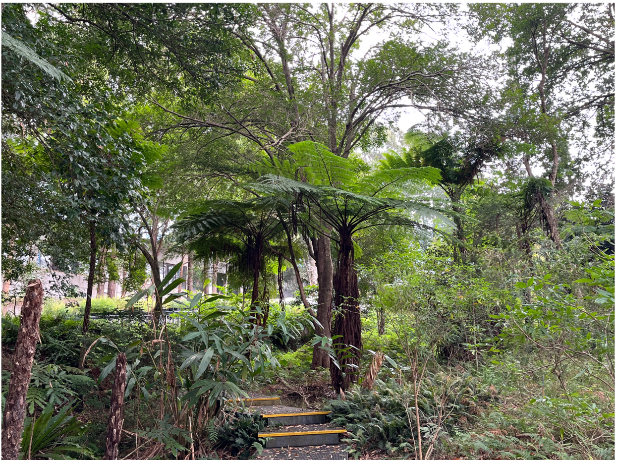
Photo 2 - Nursery steps leading up from Lloyd Rees Drive entrance to the upper levels of nursery