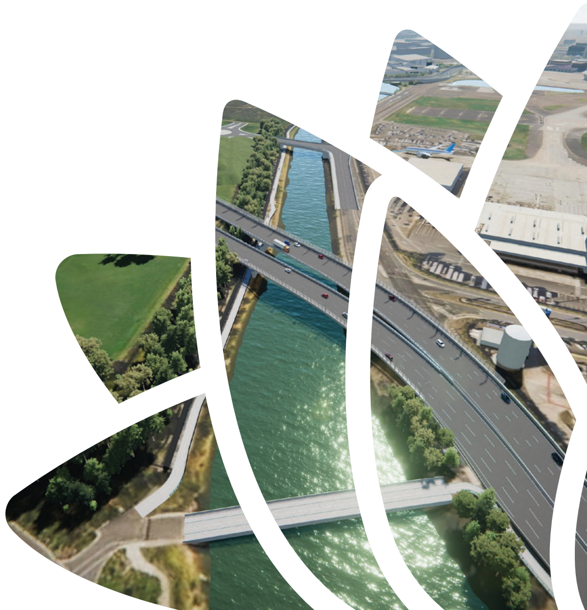
Table of contents Certification